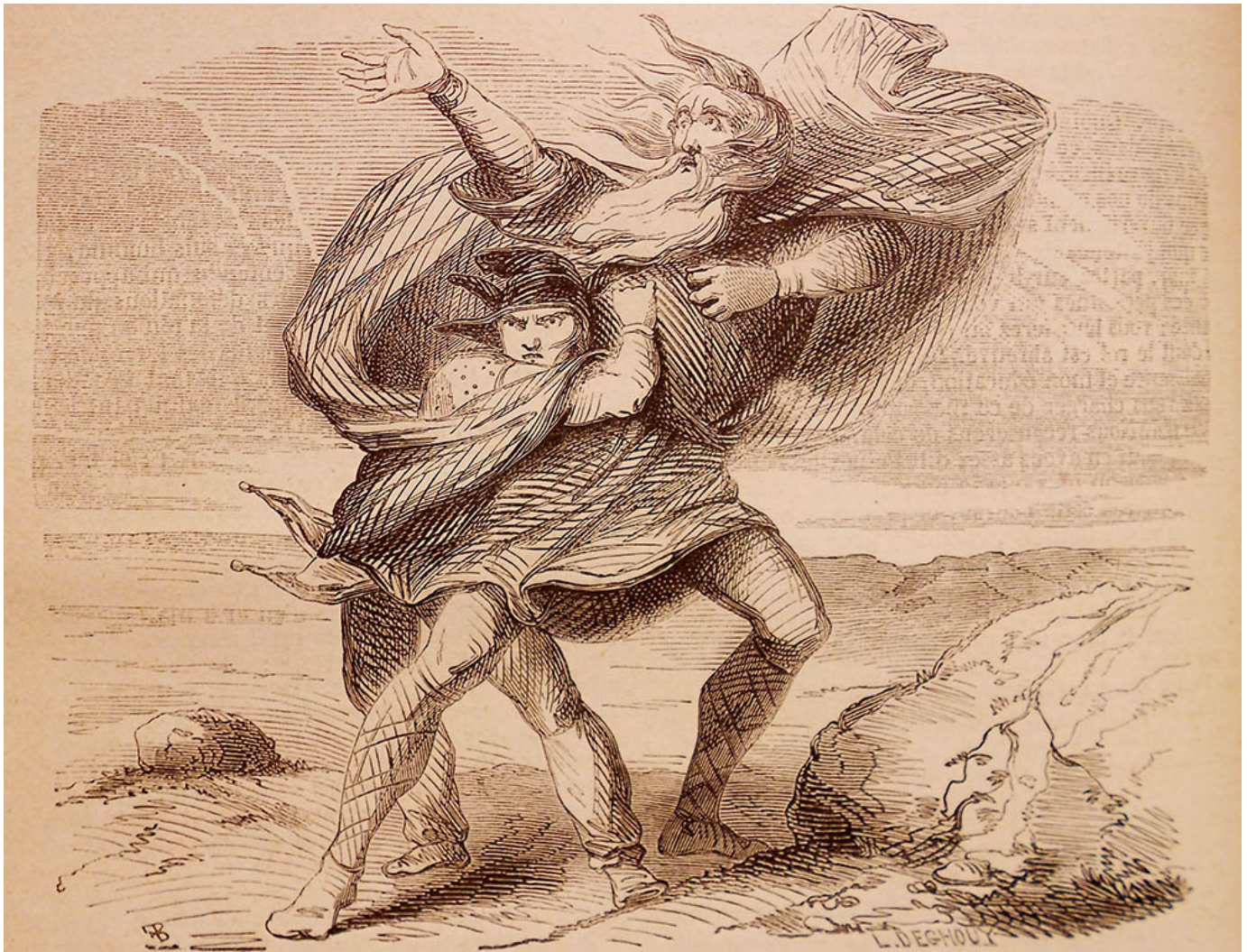
King Lear in the storm, depicted in an illustration for an 1856 edition of the complete works of William Shakespeare

Shakespeare went deep inside himself and his lifetime of experiences to create this tragedy that deals so profoundly with what it means to be human. He pushed himself to delve into that mystery. And every time I see the play, I get new and deeper insights into myself and everyone else who's human. In gaining these insights, I gain insights into God who created us all.