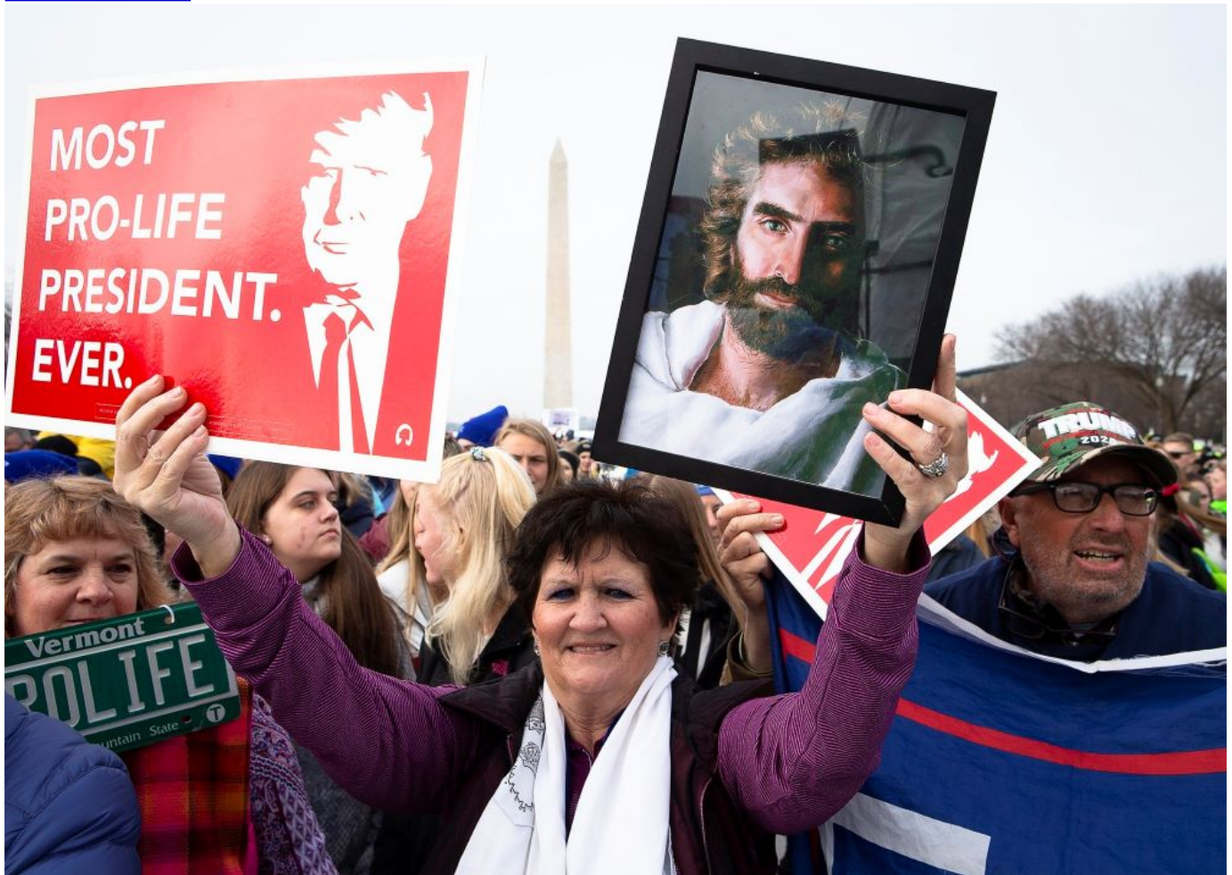
A woman holds an image of Jesus and a poster about President Donald J. Trump during the annual March for Life rally in Washington Jan. 24, 2020.