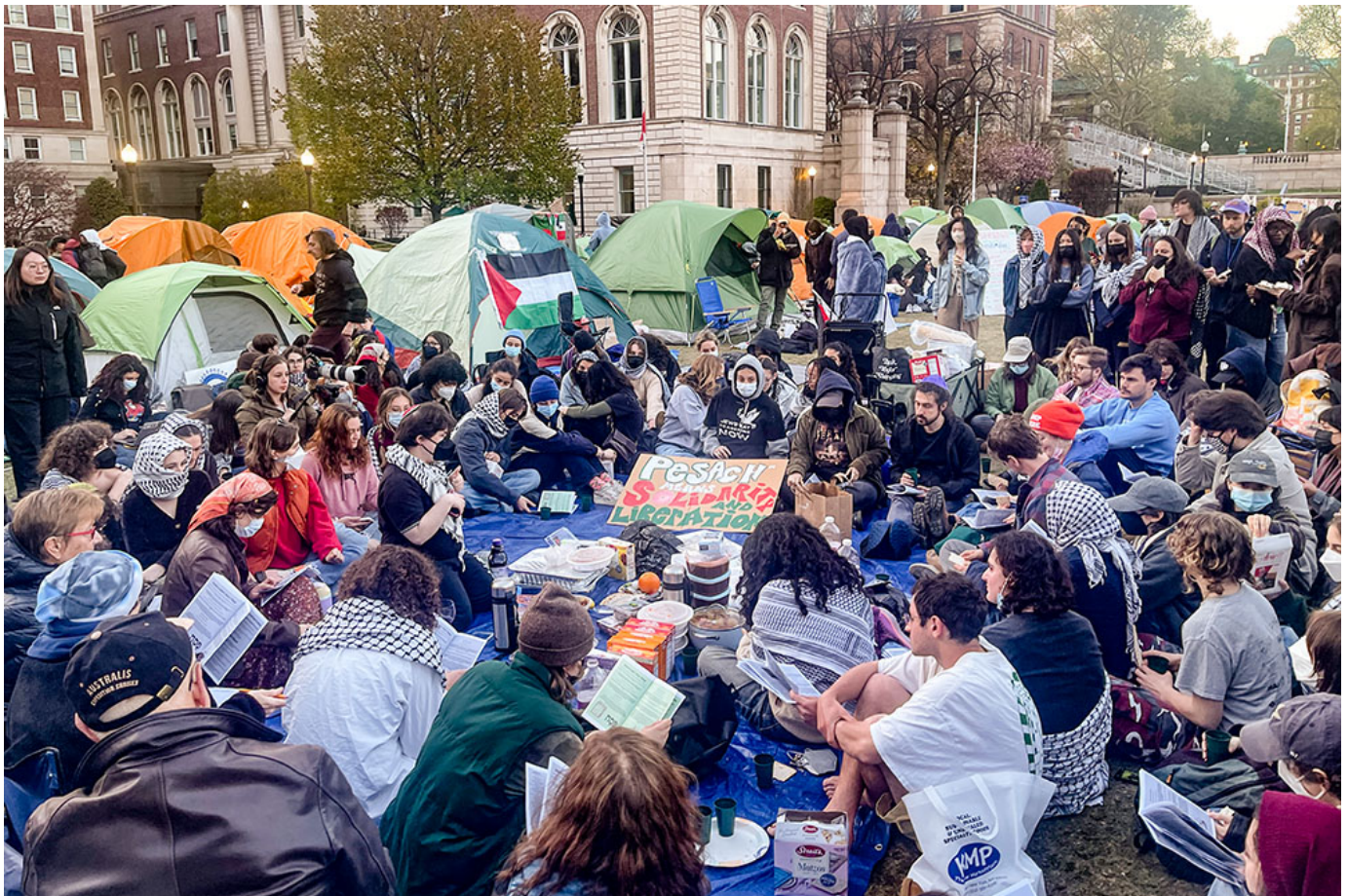
Pro-Palestinian Jewish students celebrate Passover in the "Gaza Solidarity" encampment at Columbia University in New York City on April 22.