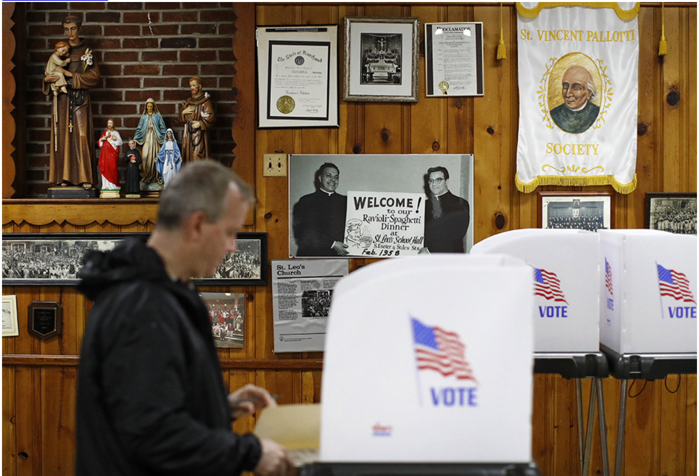
Religious artwork and vintage photographs adorn a wall behind a voter as he completes his ballot at a polling place inside St. Leo the Great Roman Catholic Church, Nov. 6, 2018, in Baltimore.