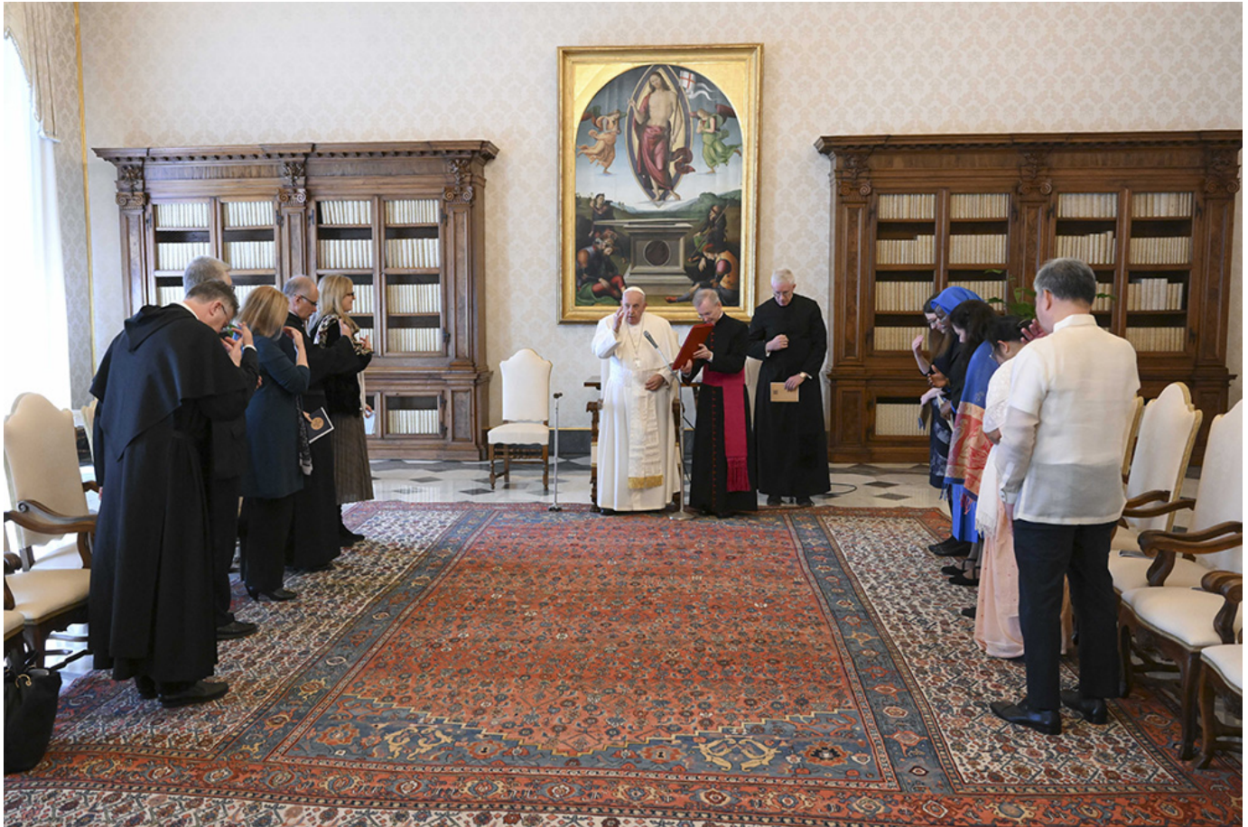
Pope Francis prays with members of the International Network of Societies for Catholic Theology in the library of the Apostolic Palace at the Vatican May 10, 2024.