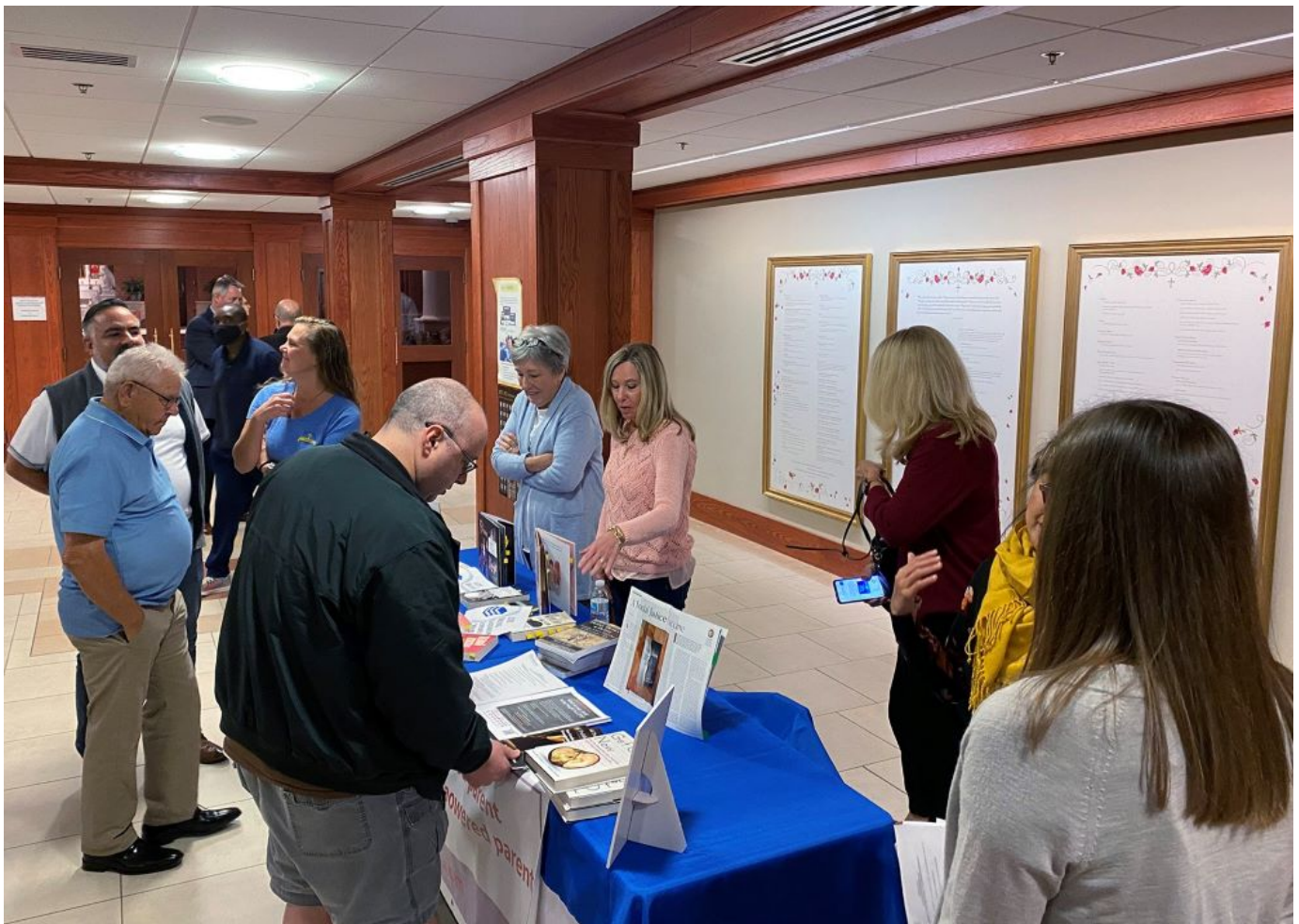
Attendees at an Oct. 23, 2021, conference on "Gender Ideology: The Cultural Challenge and the Catholic Response" browse material presented by the Parent and Child Loudoun organization at St. Theresa Church in Ashburn, Va.

"It would be important for me if I'm an educator implementing a policy to know that it was created through a multidisciplinary process, that the authors of that document represent philosophy, theology, psychology, endocrinology — all of the realms that impact the gender conversation in particular," she said. "I think any one discipline, myself included, will be incomplete in what we can offer Catholic schools."