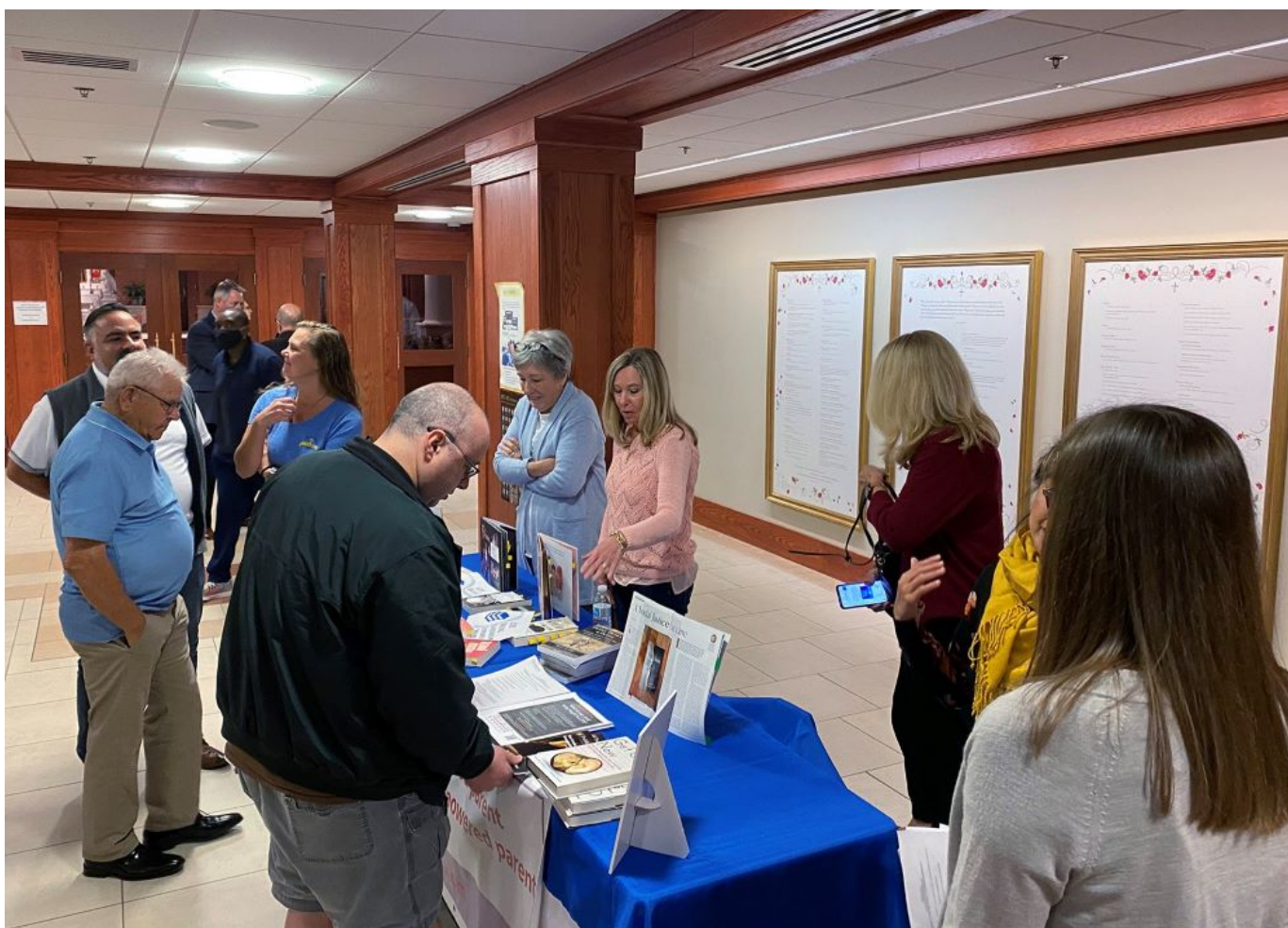
Attendees at an Oct. 23, 2021, conference on "Gender Ideology: The Cultural Challenge and the Catholic Response" browse material presented by the Parent and Child Loudoun organization at St. Theresa Church in Ashburn, Va.

"It would be important for me if I'm an educator implementing a policy to know that it was created through a multidisciplinary process, that the authors of that document represent philosophy, theology, psychology, endocrinology — all of the realms that impact the gender conversation in particular," she said. "I think any one discipline, myself included, will be incomplete in what we can offer Catholic schools."