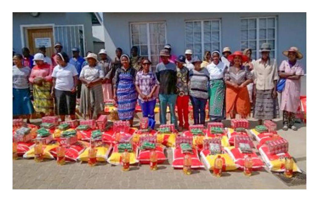
Sisters help the people with parcels of food. (Agnes Motake)

Equally important, my congregation is also known for its commitment to social justice. Inspired by the teachings of Jesus and Mary, we sisters work tirelessly to advocate for those who are marginalized and oppressed in society. We are actively involved in various social justice initiatives, such as advocating for the rights of immigrants, fighting against human trafficking, alleviating poverty, and promoting environmental sustainability.