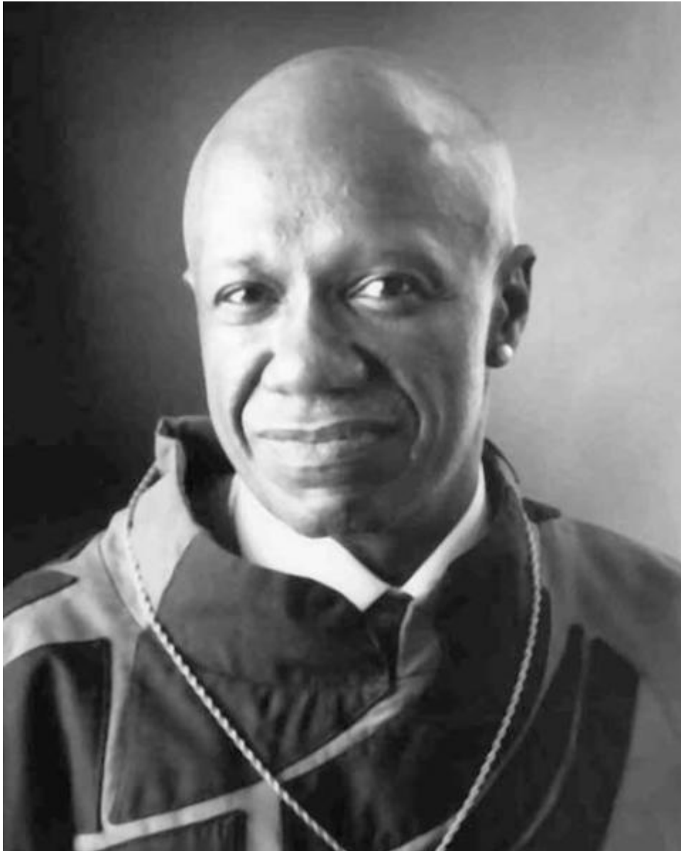
Black liturgist and musician Fr. Clarence Rivers

Elevating our Black identity and culture, Fr. Clarence Rivers served as the first Black priest for the Cincinnati Archdiocese, trailblazing in his work as a liturgical music mastermind and pioneering composer — integrating Black American gospel into the Catholic liturgy. He dismantled prevailing white liturgical standards and animated the church with an authentically Black imprimatur.