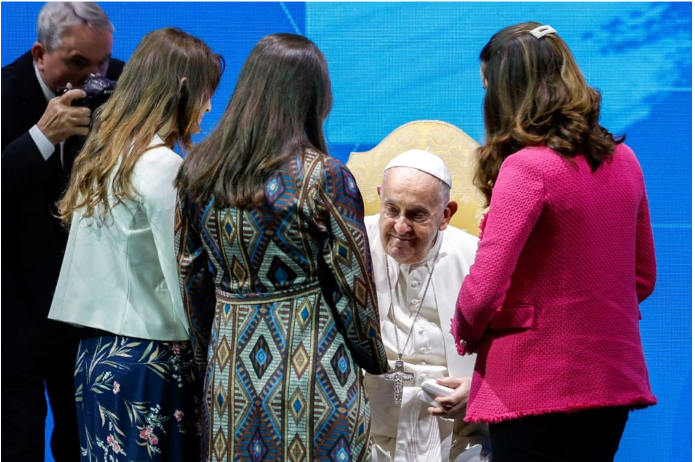
Pope Francis blesses three pregnant women at an annual meeting on Italy's declining birthrate at an auditorium in Rome May 10.