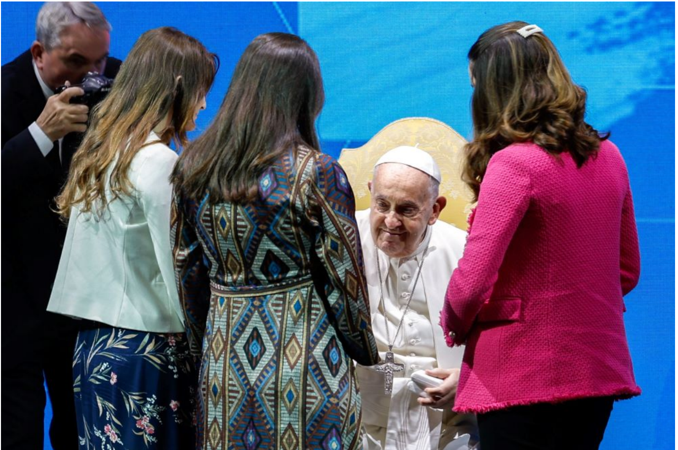
Pope Francis blesses three pregnant women at an annual meeting on Italy's declining birthrate at an auditorium in Rome May 10.