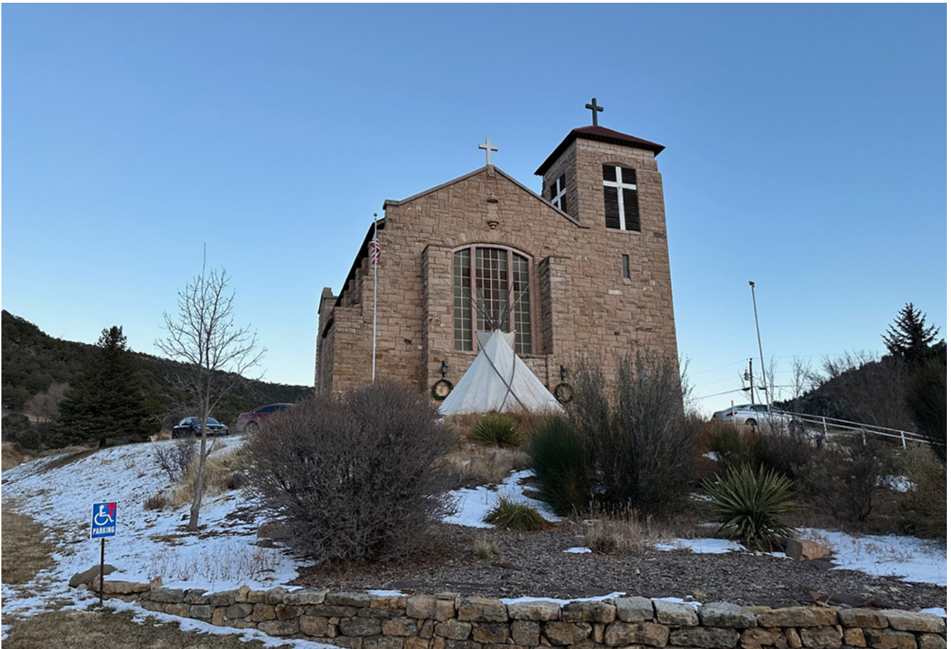
The exterior of St. Joseph Apache Mission in Mescalero, New Mexico

Through it all, our Apache friends slowly became acquainted with Christianity. Their traditional spirituality was that of a practical religion, that is, it was how they lived in the land the Creator had given them. A sense of the sacred surrounded all aspects of life. Christianity, being missional or evangelical, could puzzle them. For example, their earliest contacts with Spanish Jesuit missionaries coming up from New Spain was typically at arm's length. They thought of them as witches, because, among other observations, Jesuits always had a supply of food, wore heavy black robes even during the hot summer months, and did not live with women. In the end, they decided to allow them to live, because the Jesuits were a source of food.