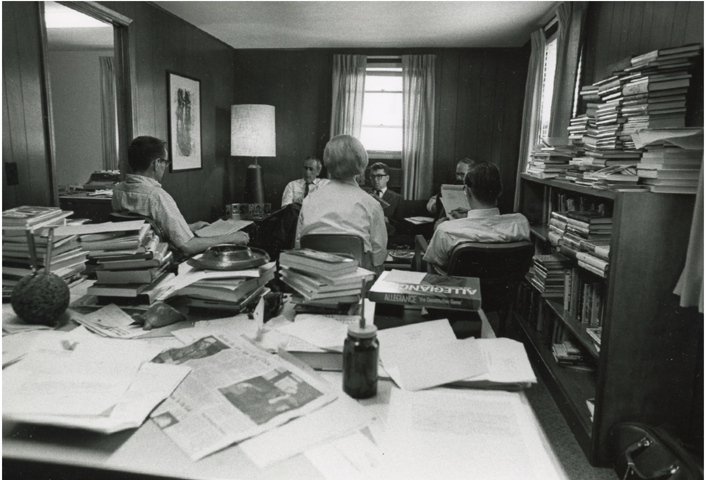
NCR staff are pictured inside the company's headquarters in Kansas City, Missouri, in this 1968 photo. NCR's first issue appeared in October 1964, amid the Second Vatican Council.

From 1962 through 1965, top church leaders, under the aegis of the Second Vatican Council, gathered in Rome and called for church reform, peace, and justice in the wider world. At that moment, it seemed like anything could be achieved. Understanding NCR's roots during those times is essential to understanding the fullness of the NCR journalism mission, the commitments of its staff and board of directors, and the power behind its endurance for nearly six decades now.