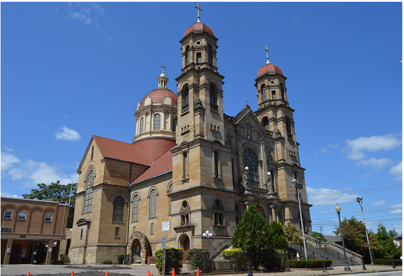
St. Peter Catholic Church in Steubenville, Ohio, is pictured in an Aug. 22 photo.