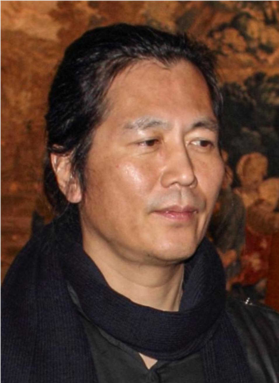
Byung-chul Han, author of The Crisis of Narration

There might be something worth exploring in each of these arguments, but Han eschews evidence and nuance in favor of superficial clichés. Nowhere is this more evident than his blithe assertion that humans have transformed from homo sapiens into " phono sapiens ." His arguments are only slightly more polished versions of underinformed technophobia.