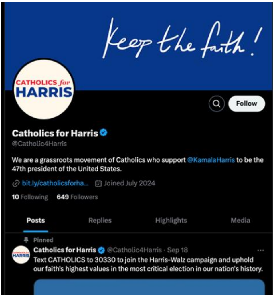
A screenshot of the Catholics for Harris account on X