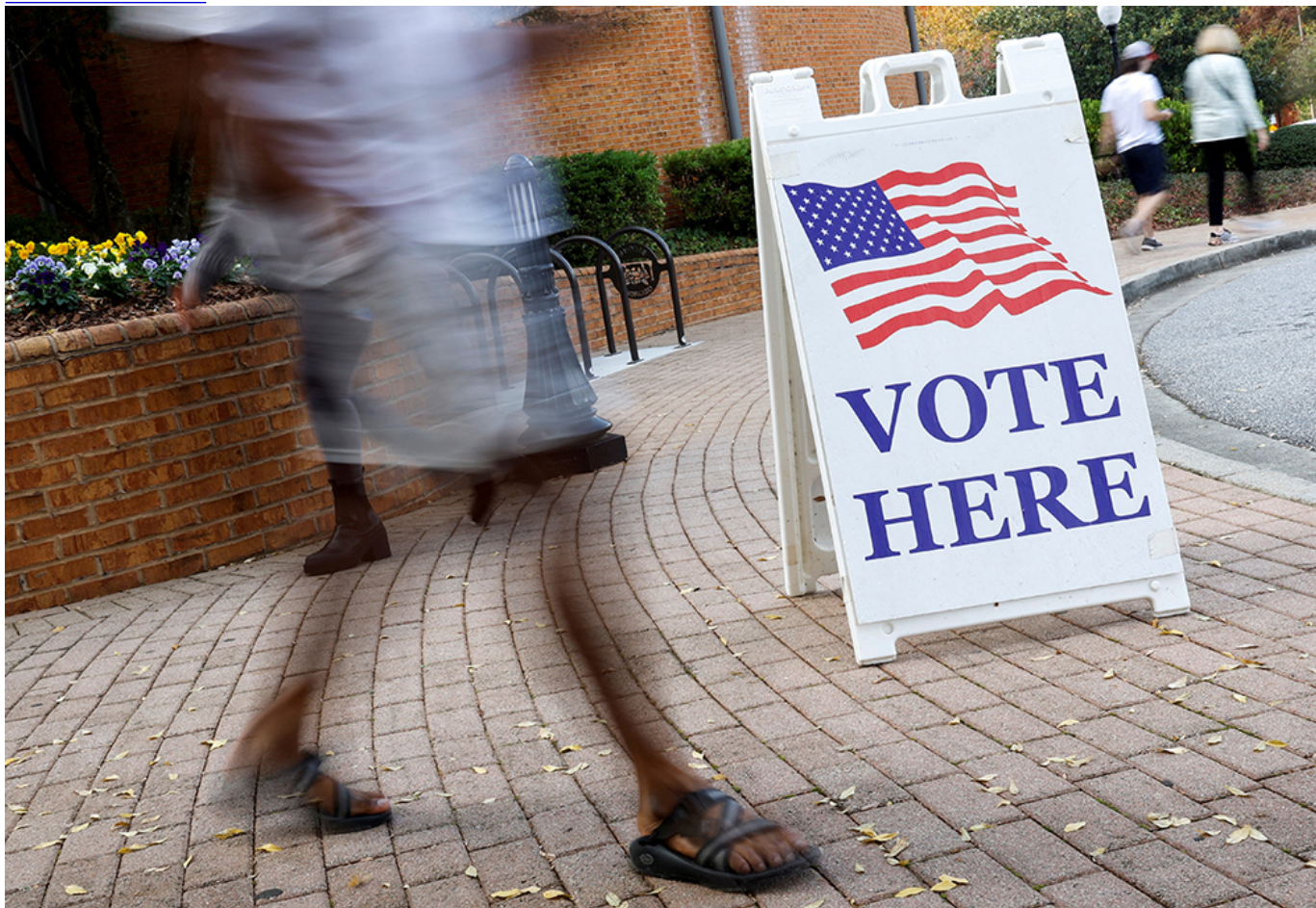
People at the Smyrna Community Center in Smyrna, Georgia, visit an early voting location Nov. 3, 2022, during midterm elections.