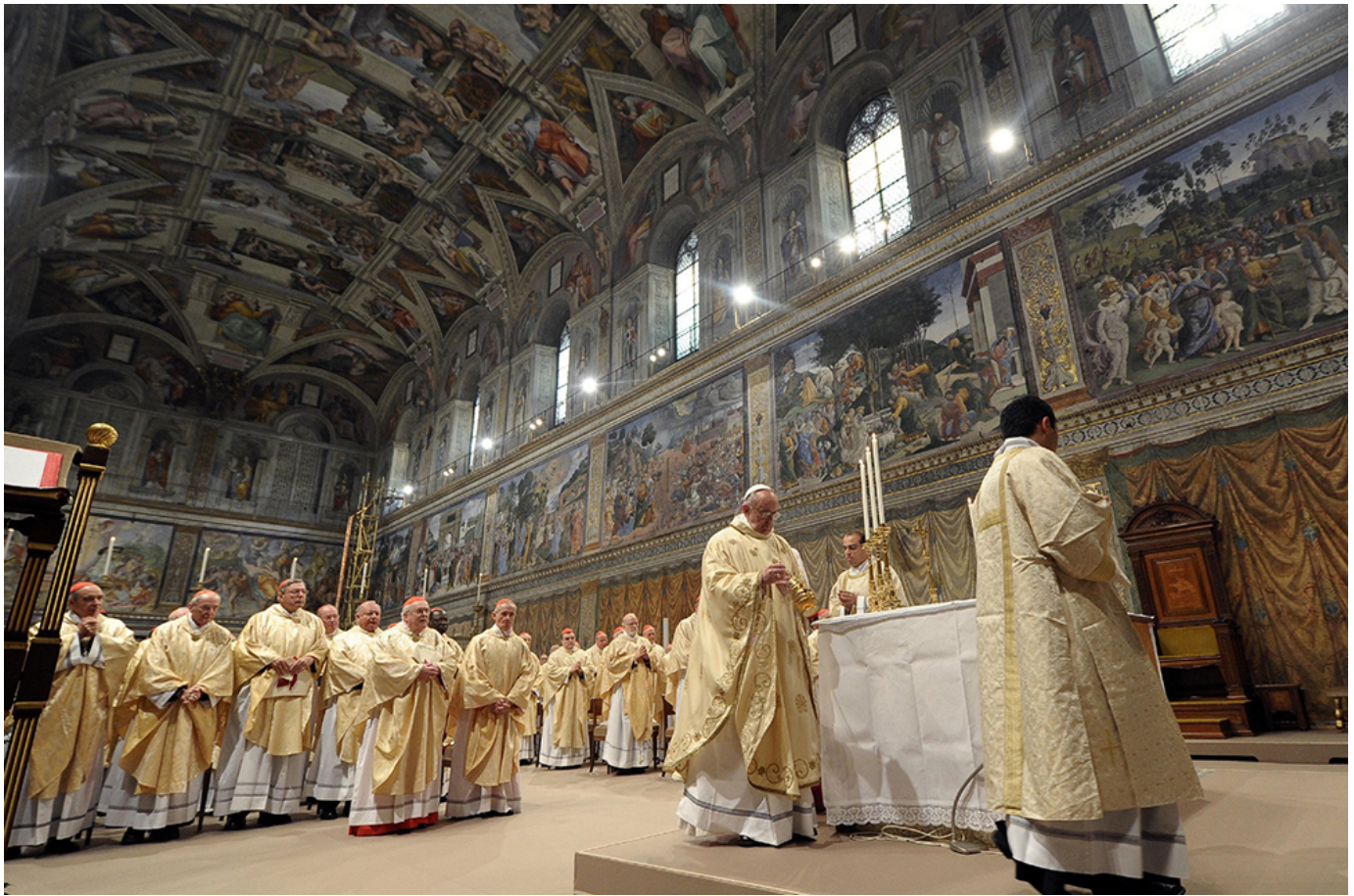
Pope Francis celebrates Mass with cardinal electors in the Sistine Chapel at the Vatican March 14, 2013, the day after his election.

'What the disruptor pope has disrupted is our spiritual and intellectual complacency.'