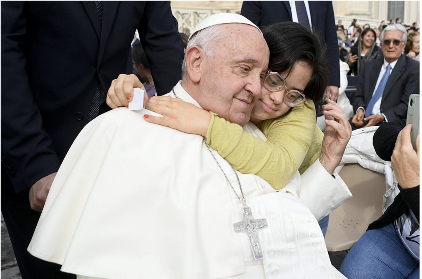
Pope Francis receives a hug from a child after his weekly general audience in St. Peter's Square at the Vatican Oct. 9, 2024.