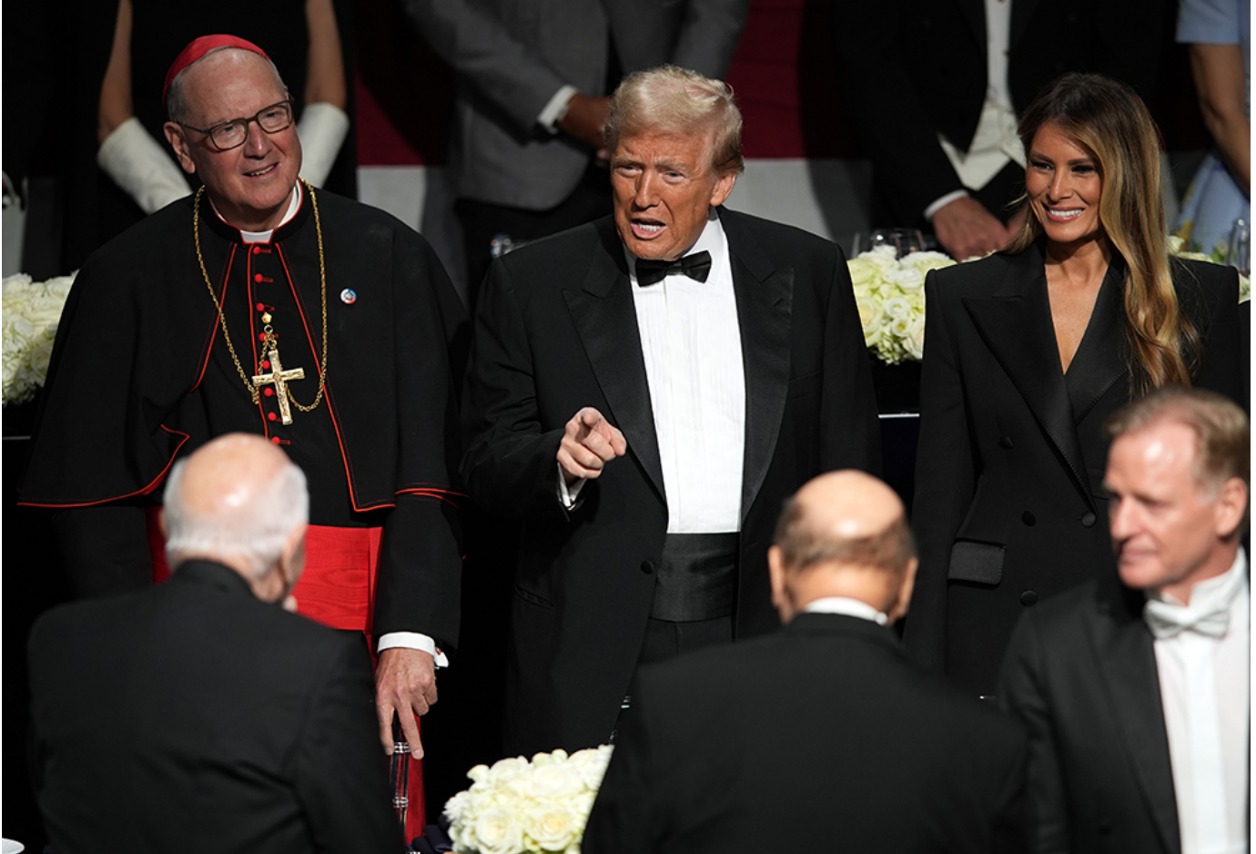
Republican presidential nominee former President Donald Trump and former first lady Melania Trump arrive for the 79th annual Alfred E. Smith Memorial Foundation Dinner, Oct. 17 in New York.