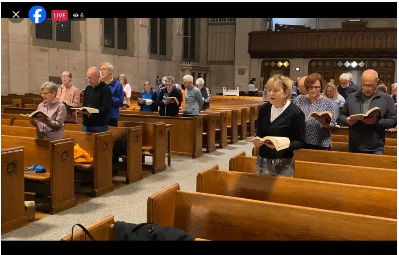
More than 60 members of St. Gertrude Parish in Chicago gather Nov. 4 for an election prayer service.

"They 'saw Trump coming, long ago.' I'm hoping that our thesis that the US system is robust enough to thwart an impetuous bully will not be put to the test."