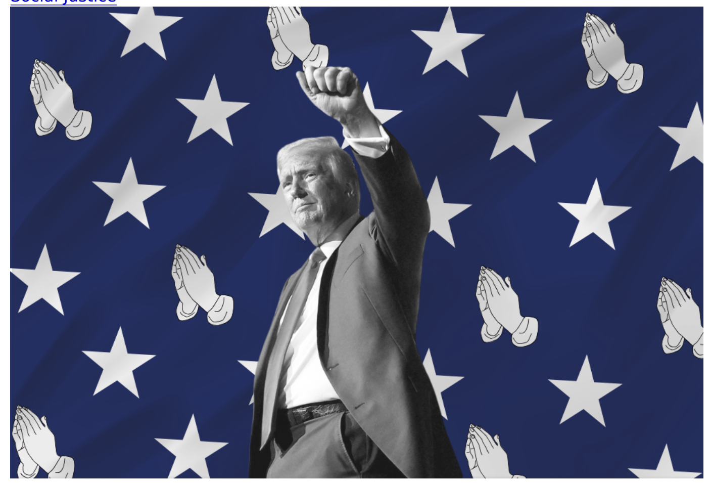
(GSR graphic/Olivia Bardo; OSV News photo/Reuters/Brian Snyder)