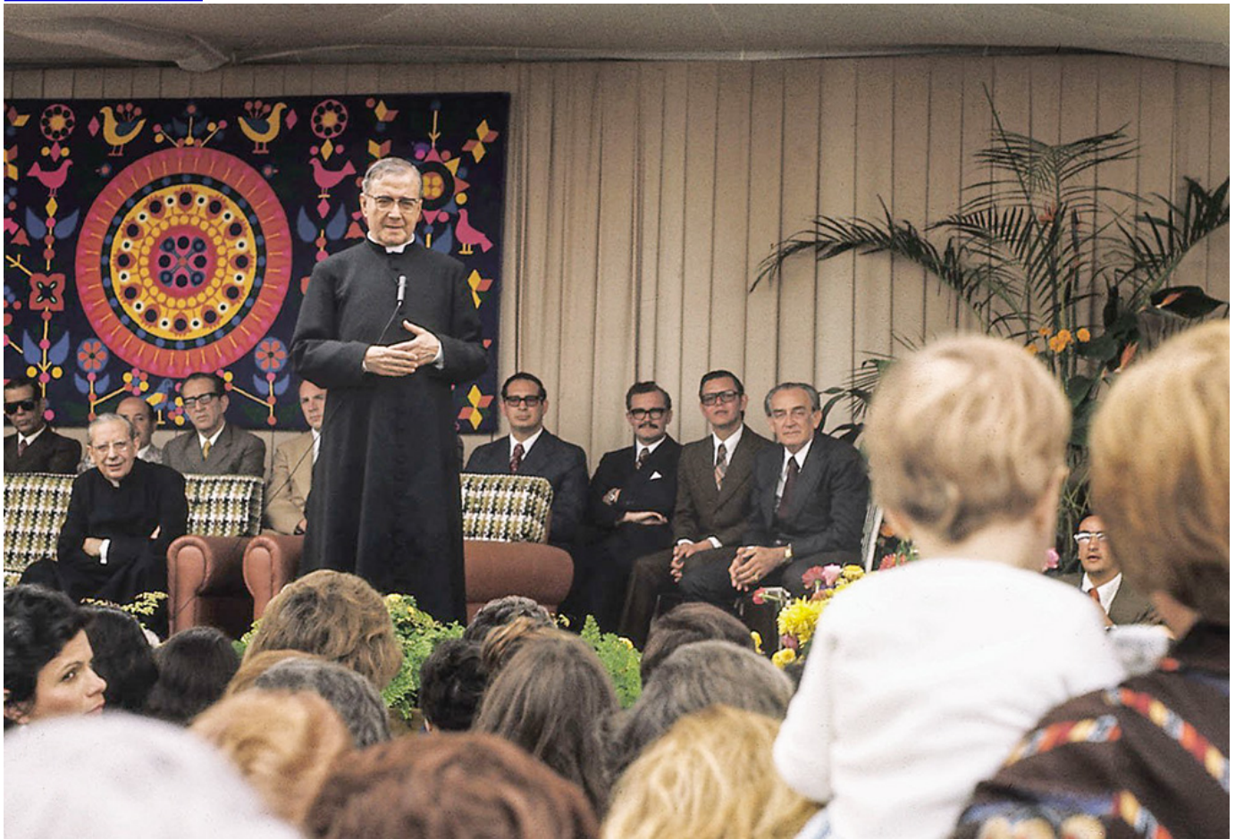
St. Josemaría Escrivá, founder of Opus Dei, in Venezuela in 1975