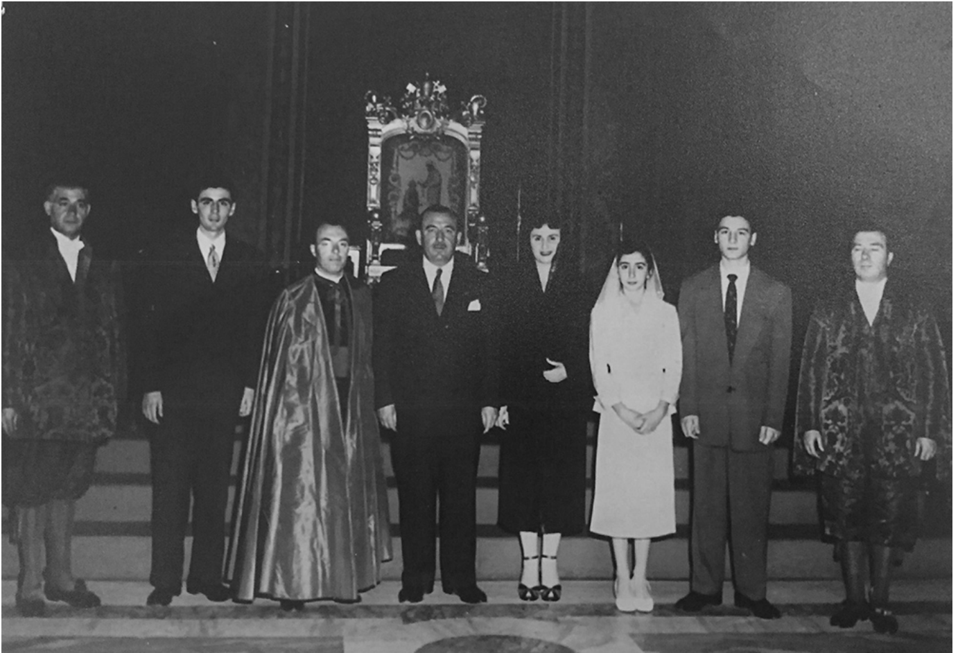
Former House Speaker Nancy Pelosi (in white dress) with her family during a visit at the Vatican in 1954.

Then, she paused, closed her eyes and quoted the Gospel of Matthew. " 'When I was hungry, you fed me. When I was naked, you clothed me. When I was homeless, you sheltered me. When I was a stranger, you welcomed me. When I was in prison, you visited me' — except right now," she said.