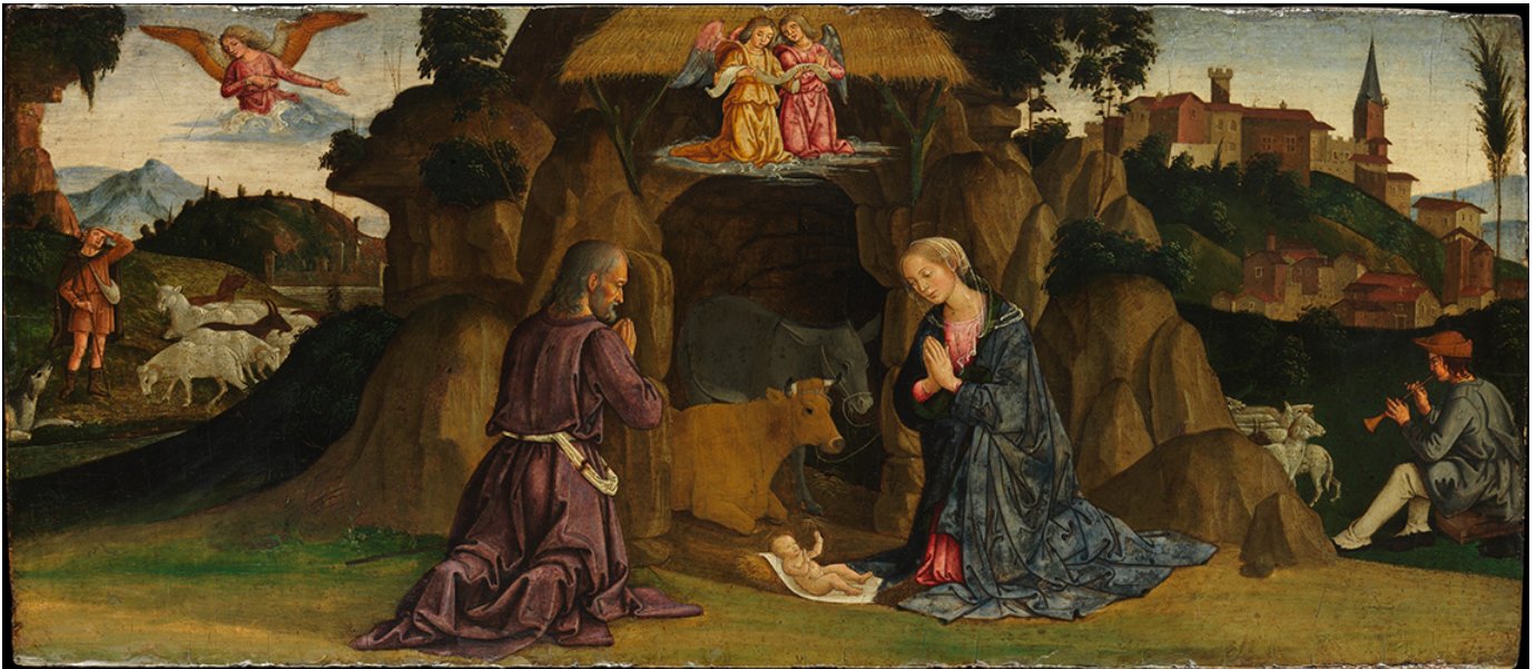
"The Nativity," circa 1480s painting by Antoniazio Romano (Metropolitan Museum of Art)

in an interview for U.S. Catholic, "It is easier for a tradition that has historically had a lot of power to talk about love of enemies than it is for people who have struggled to survive for centuries."