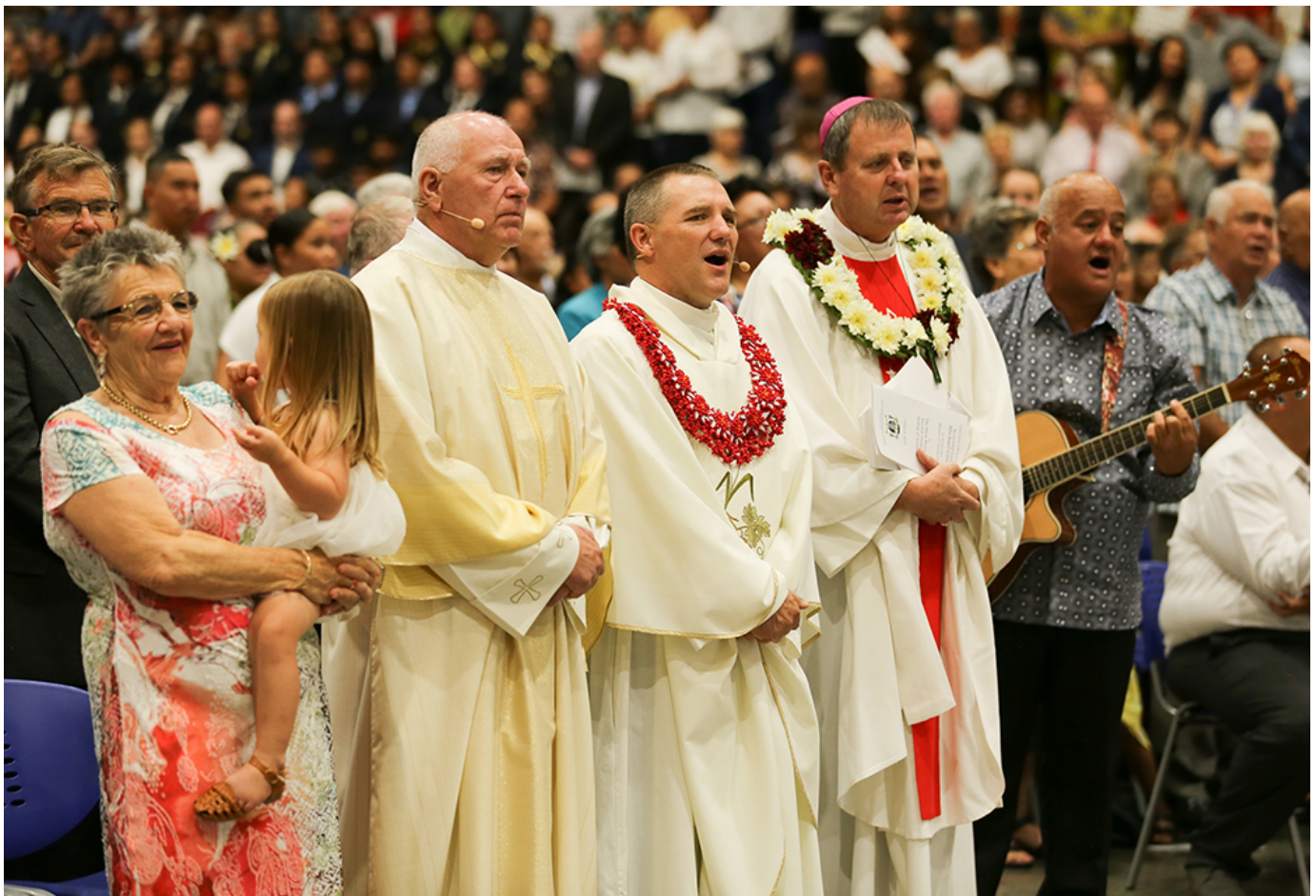
Family members and others are seen during the Maori welcome just before the episcopal ordination Mass at the Vodafone Events Centre in south Auckland, New

Also, lament must be accompanied by some display of consequences and restoration for the harm done. In Jeremiah's poignant example (Jeremiah 20:7-18), he never stayed focused on God but moved quickly to express his oppressive situation and concluded with a wish that he had never been placed in such a position.