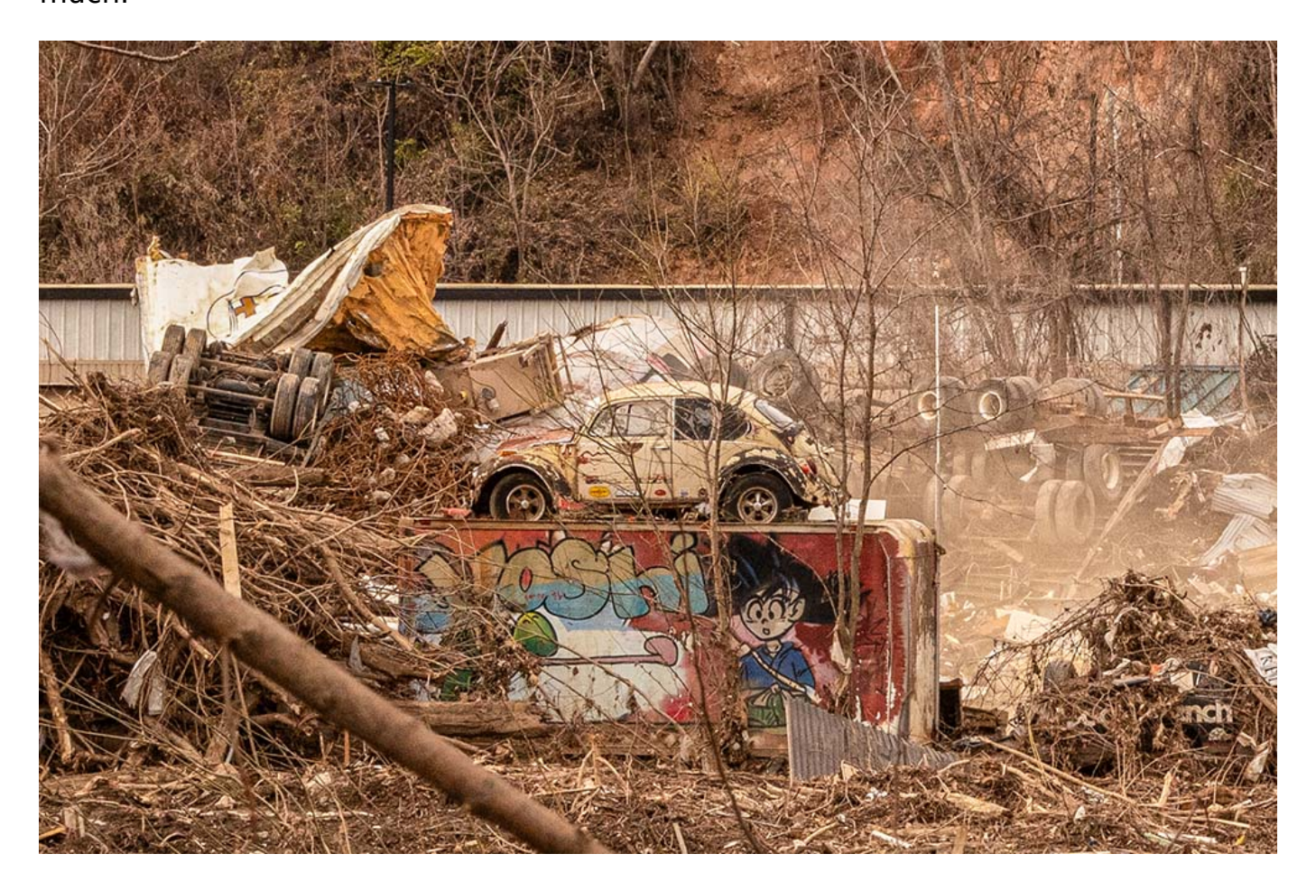
Volkswagen and art, on banks of Swannanoa River, near Biltmore Village, Dec. 13, 2024

Three months have passed, and the Christmas season is here. I am wondering what it means to celebrate in a time of tragedy, at a time when so many have lost so much.