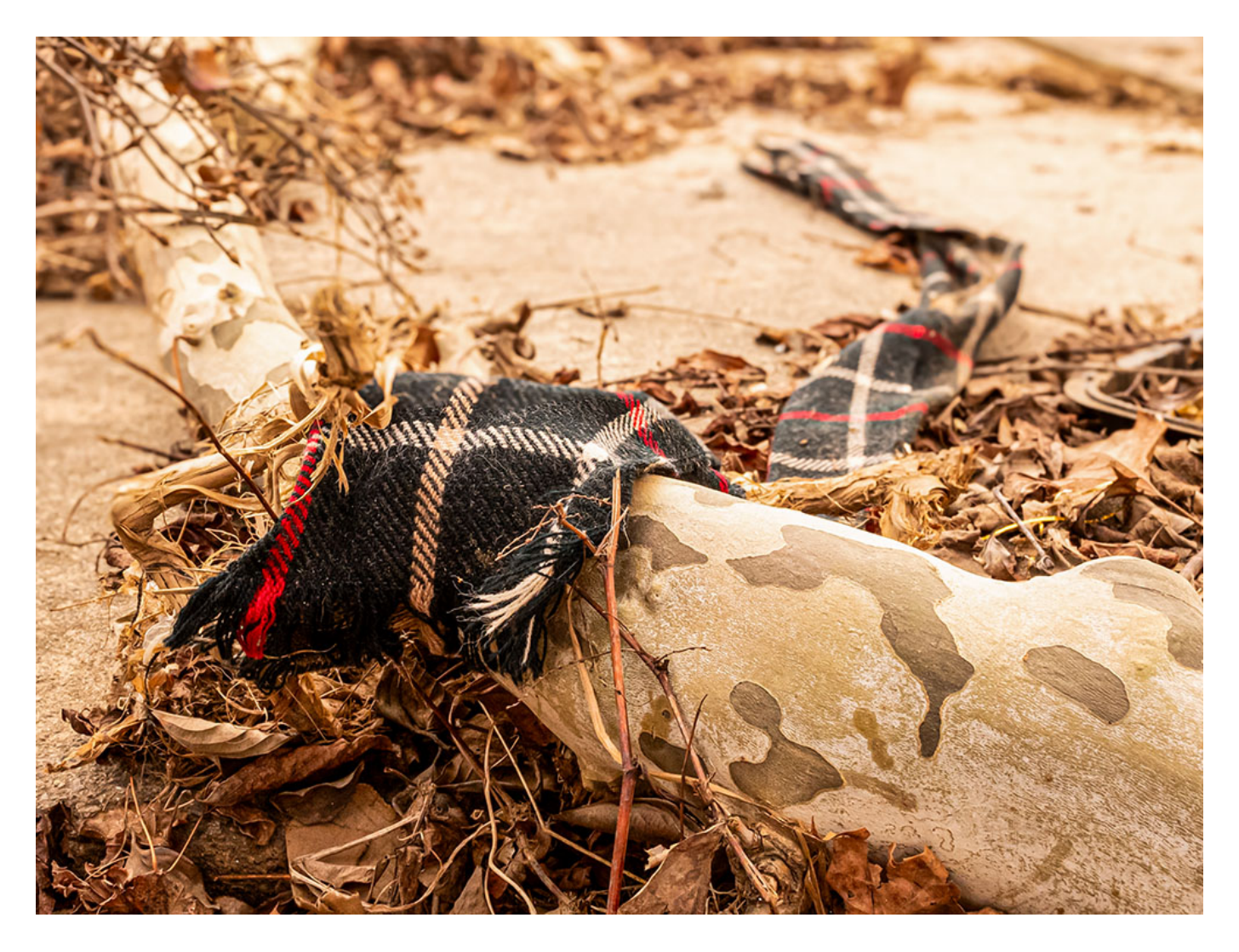
Plaid scarf, on banks of Swannanoa River, near Biltmore Village, Dec. 13, 2024 (Darlene O'Dell)

How do we live with a sense of hope and peace when the mind is trapped in a state of disbelief? When a world lying in solemn stillness carries grim significance?