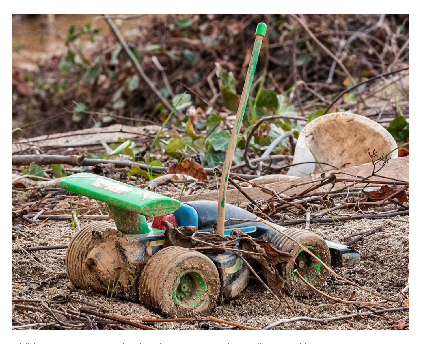
Child's toy race car, on banks of Swannanoa River, Biltmore Village, Dec. 11, 2024 (Darlene O'Dell)