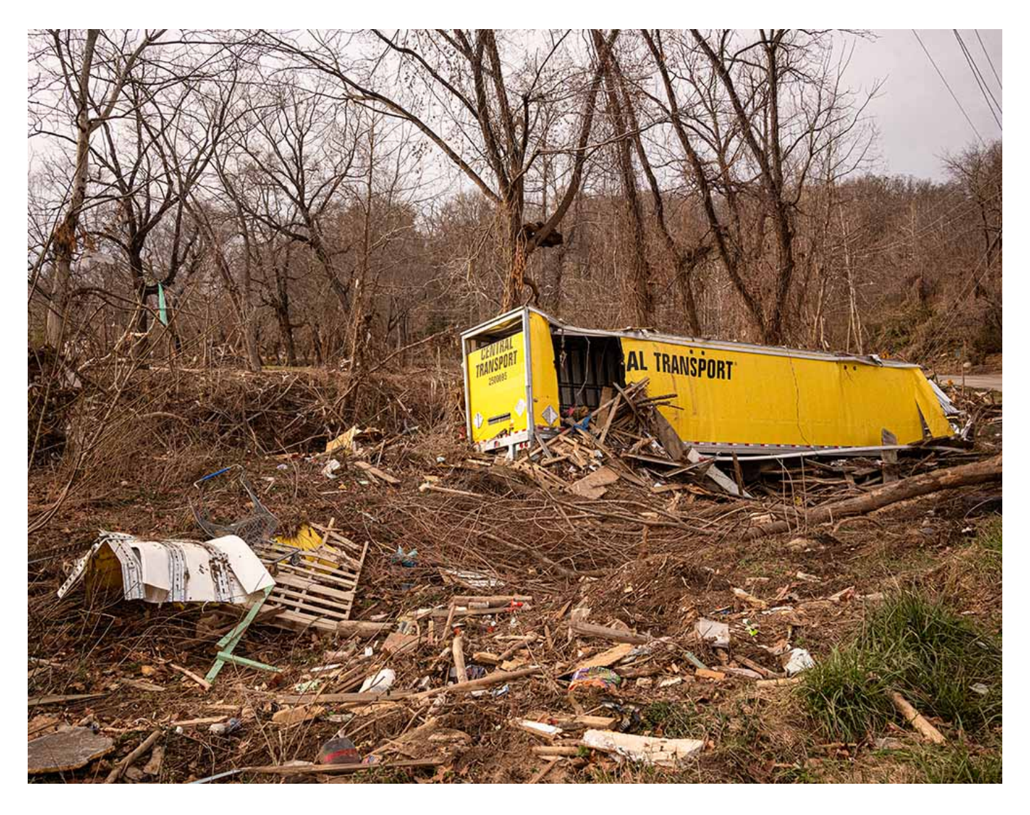
Yellow truck on banks of Swannanoa River, Swannanoa River Road, approximately 3 miles east of Biltmore Village, Dec. 13, 2024 (Darlene O'Dell)

When people who have lost homes, businesses, and a sense of safety are heard making statements like, "I was one of the lucky ones"? What does Christmas say to us in these times? What does it say to those who lost loved ones?