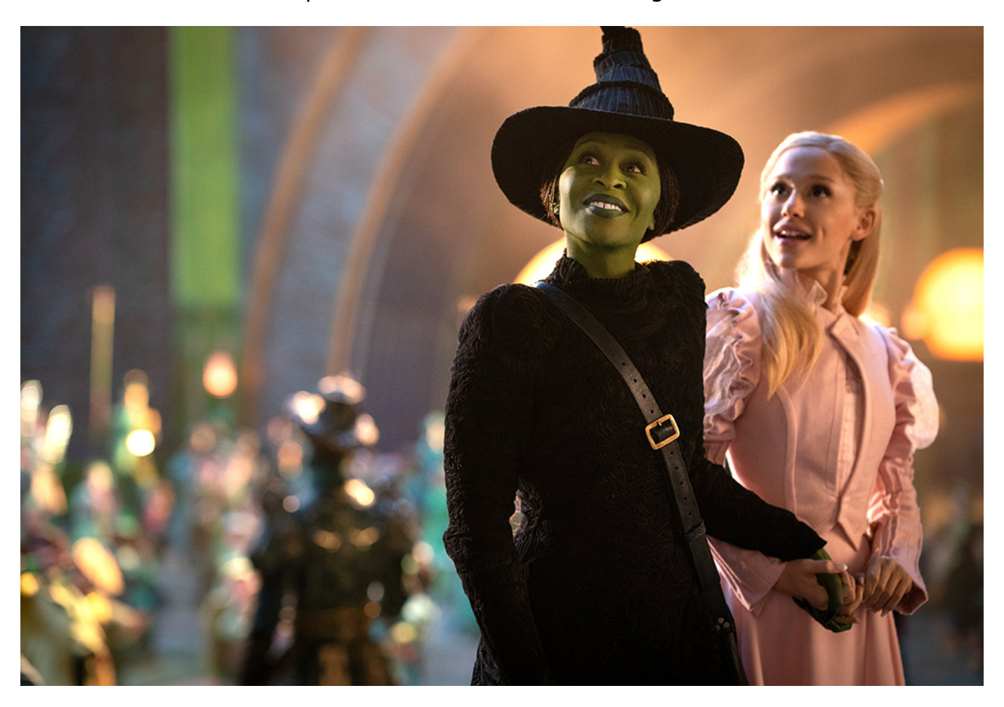
Cynthia Erivo and Ariana Grande star in the movie "Wicked."

Even before director Jon M. Chu's "Wicked" arrived in theaters, the film's political urgency was palpably felt. The climax of the film revolves around the blossoming witch Elphaba (Cynthia Erivo) realizing that the Wizard (Jeff Goldblum), ruler and benefactor of the land of Oz, possesses no magical power of his own and has been manipulating public opinion to keep himself in power by placing blame on a marginalized group. The parallels write themselves. Many viewers saw their own inner state reflected in Elphaba's disillusionment and rage.