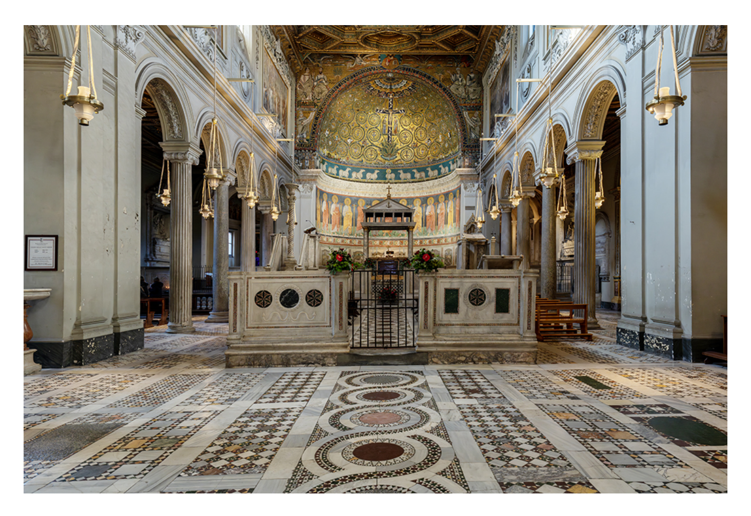
The interior of the Basilica di San Clemente in Rome

This year marks the 1,700th anniversary of the Council of Nicaea. Unlike the long-forgotten excavated remains of the earlier church at San Clemente, every Sunday we recite the creedal formula the bishops devised and approved at Nicaea. The words have great staying power, still affecting our existence in such a palpable way. "Let us stand and recite our Creed" or "the Creed," the celebrant says, not "their Creed." Adherence to the Nicene Creed remains a necessary marker of orthodoxy.