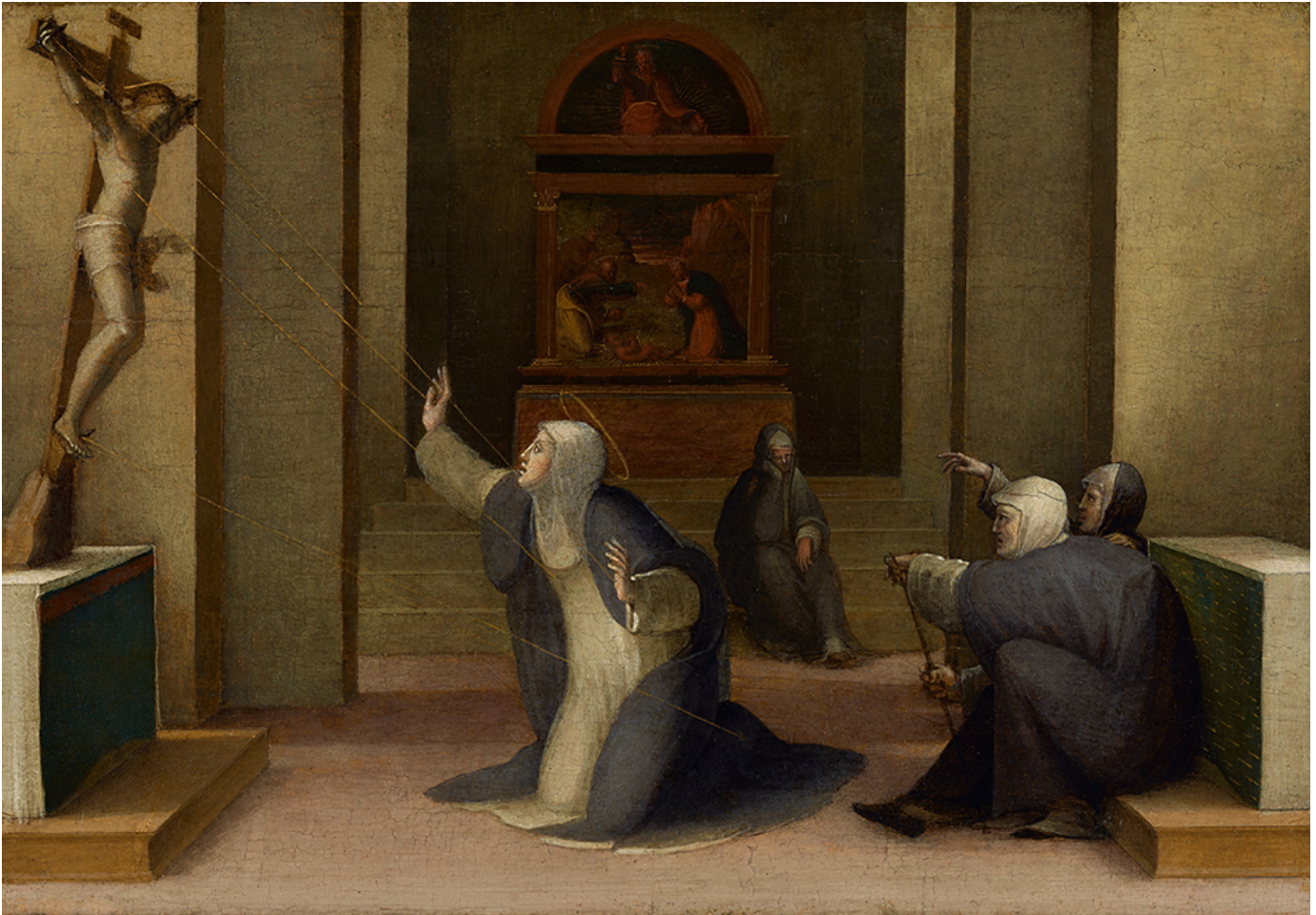
"Saint Catherine of Siena Receiving the Stigmata," an 1513-1515 painting by Domenico Beccafumi (J. Paul Getty Museum, public domain)