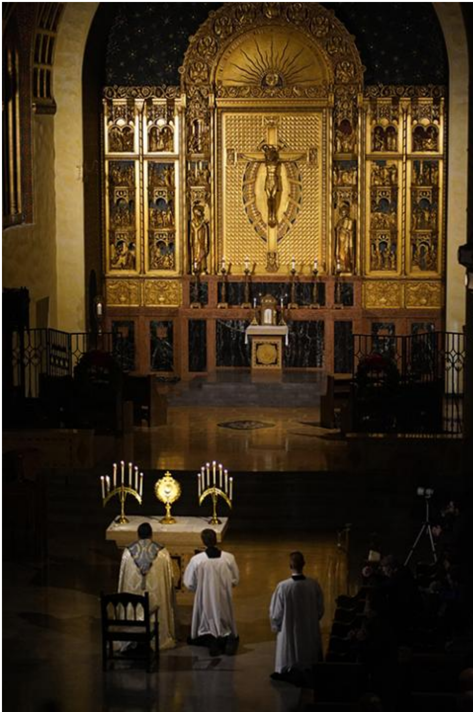
The Rockville Centre Diocese's vocations office sponsored a "Holy Hour for Vocations" prayer service pictured at Immaculate Conception Seminary on Jan. 6, 2023, in Huntington, New York. About 600 sex abuse survivors will receive about $323 million from the diocese starting in 2025.