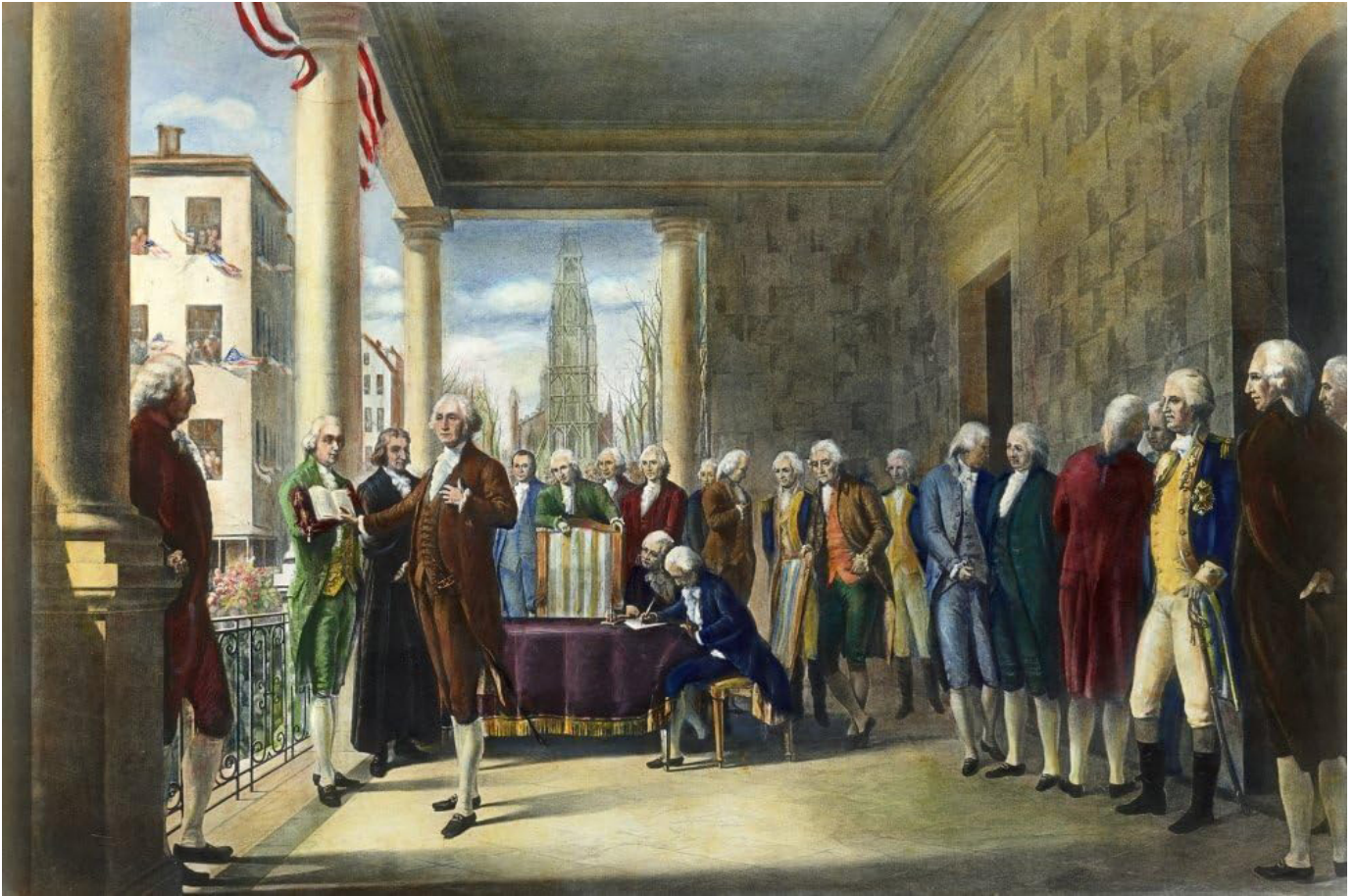
Oil painting of George Washington's inauguration as the first President of the United States which took place on April 30, 1789. (Ramon de Elorriaga/Encyclopedia Britannica/Wikimedia Commons)