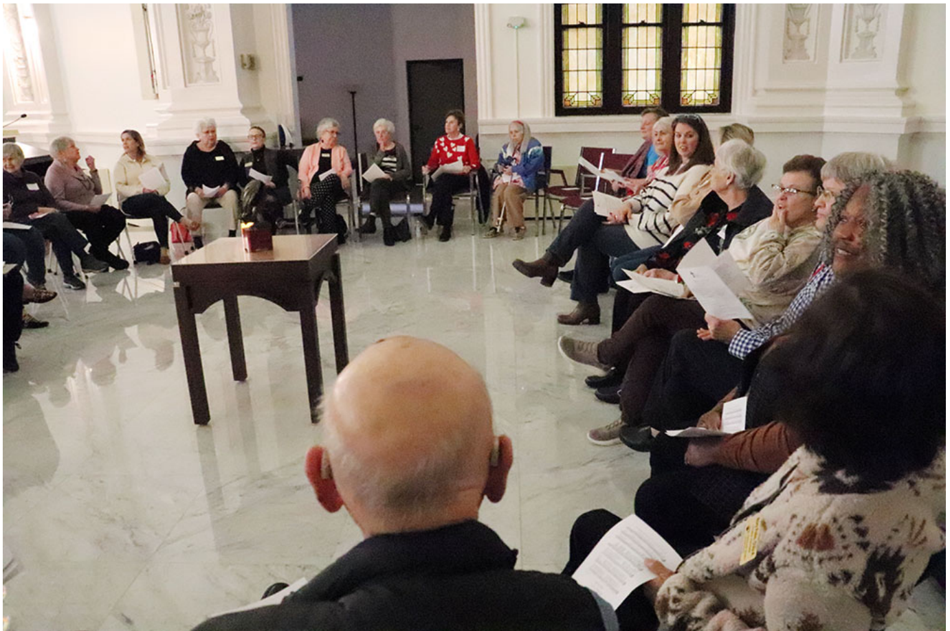
Associates of the Ursuline Sisters of Louisville meet at an associates meeting in February 2024.