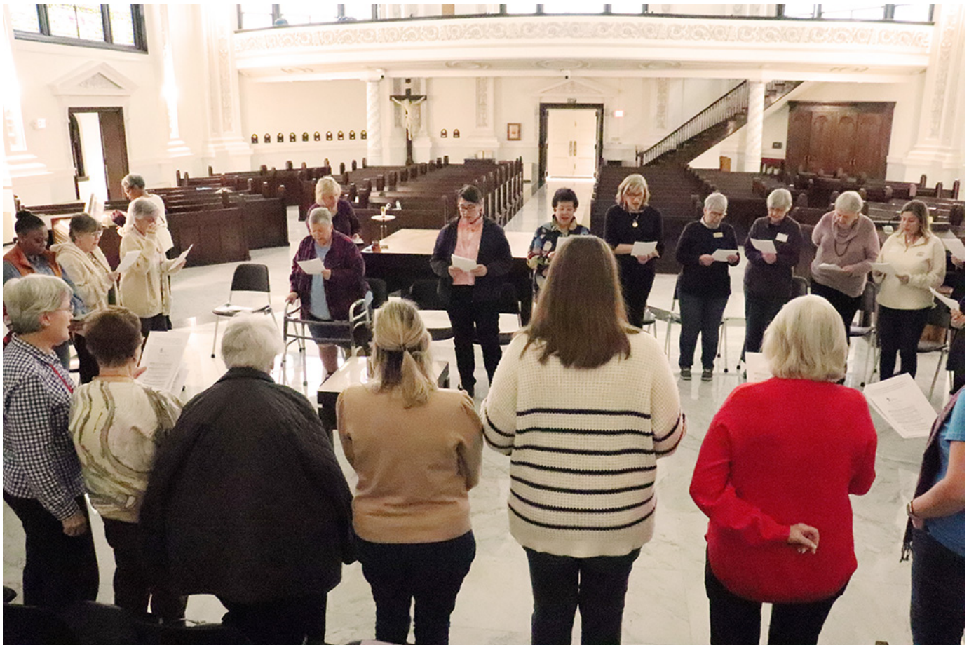
Associates of the Ursuline Sisters of Louisville pray in the congregation's chapel at an associates meeting in February 2024.