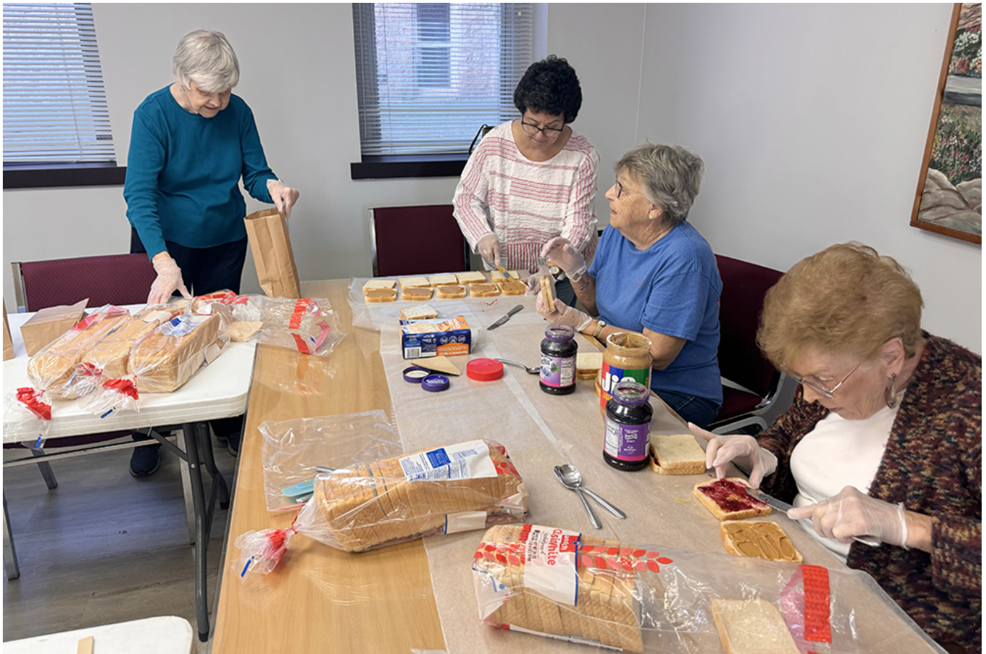
Associates of the Ursuline Sisters of Louisville make sandwiches for the homeless in Louisville, Kentucky.