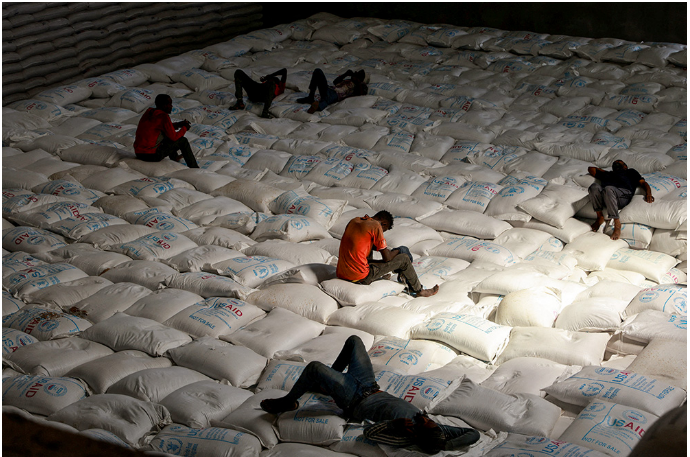
Laborers rest as they offload bags of grains at the World Food Program warehouse in Adama, Ethiopia, Sept. 8, 2022.