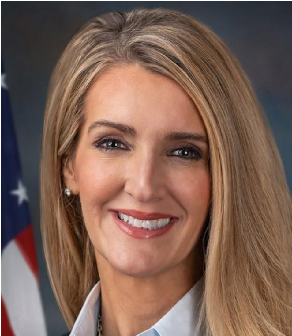
Kelly Loeffler

Faith background: In an interview with EWTN, Kennedy said that his faith helped him overcome his drug addictions. His Catholic faith, specifically St. Francis of Assisi, is also said to have inspired his environmental activism. He wrote a children's book about St. Francis.