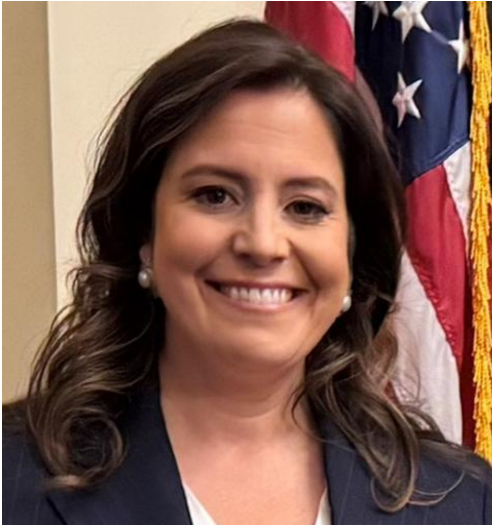
Elise Stefanik