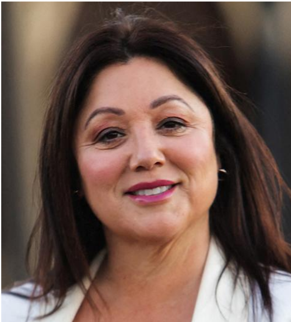
Lori Chavez-DeRemer