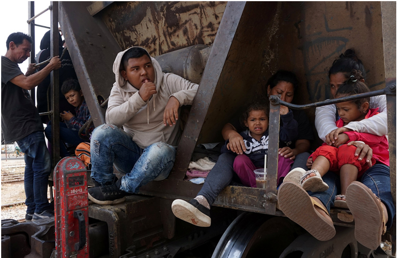
Central American migrants, moving in a caravan through Juchitan, Mexico, are pictured in a file photo on a train during their journey toward the United States.

Because migration is not just movement — it is exchange. Those who leave their homelands often send back more than memory; they send billions in remittances, sustaining families, communities and entire economies. In the U.S., immigrants contribute far beyond what they take, paying into tax systems, bolstering social security, and filling labor shortages that would otherwise fracture industries. But the impact of migration is not just economic. It is cultural, spiritual. It is a sharing of stories, traditions, a theology of survival and resilience. Immigrants remind us that the church is not bound by borders but by the hospitality of God. In them, we do not find mere laborers or taxpayers — we find teachers, healers, entrepreneurs and prophets.