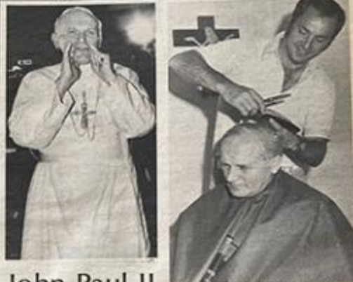
John Paul II