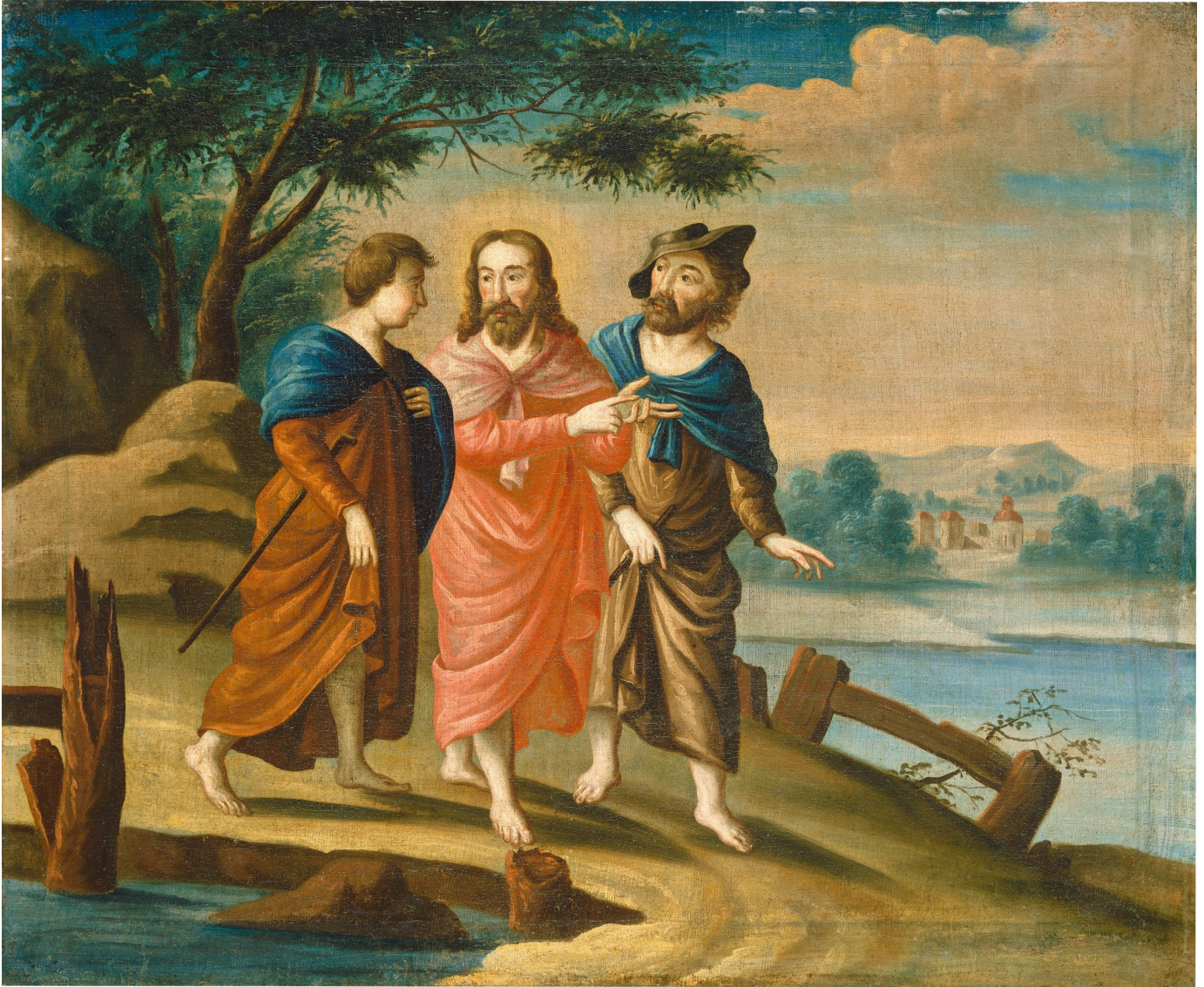
"Christ on the Road to Emmaus," c, 1725/1730.