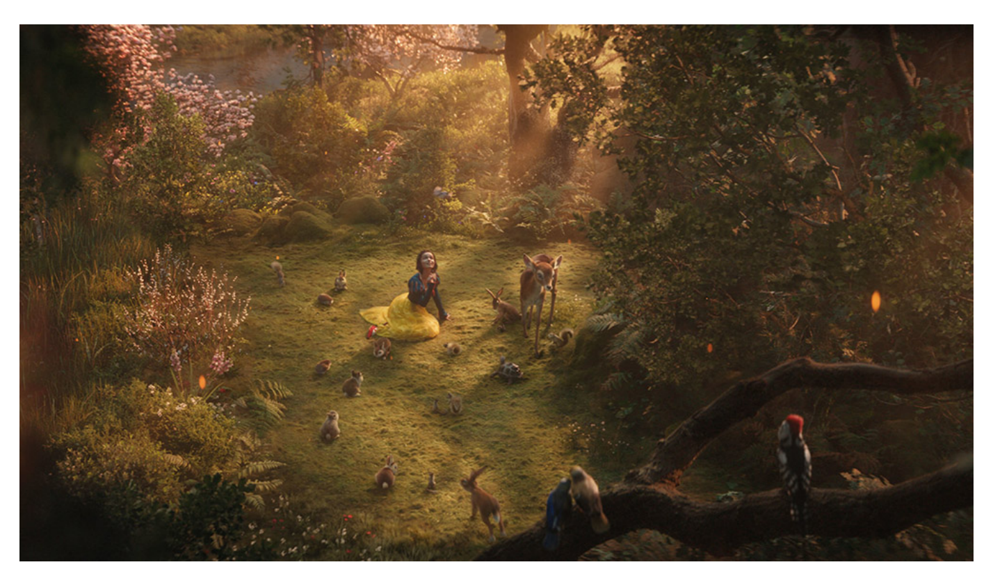
Snow White (Rachel Zegler) finds an antidote to the kingdom's scarcity in the mystery and possibility of the forest. (Disney)

The choice is clear: We can be enchanted by the unknown and turn to curiosity and wonder, or we can close ourselves off and hoard only that which we can grasp. The former allows for ever-expanding relationships, a widening of the circle, new frontiers and possibilities; the latter necessitates mistrust of others, a lowering of horizons and the shuttering of borders.