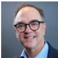
James V. Grimaldi

Disgraced former Cardinal Theodore McCarrick, seen in this 2011 file photo, died April 3 at age 94. McCarrick was laicized in 2019 after public allegations of serial sexual misconduct. He became the highest-ranking Catholic cleric in the U.S. to face criminal charges for sexual abuse.