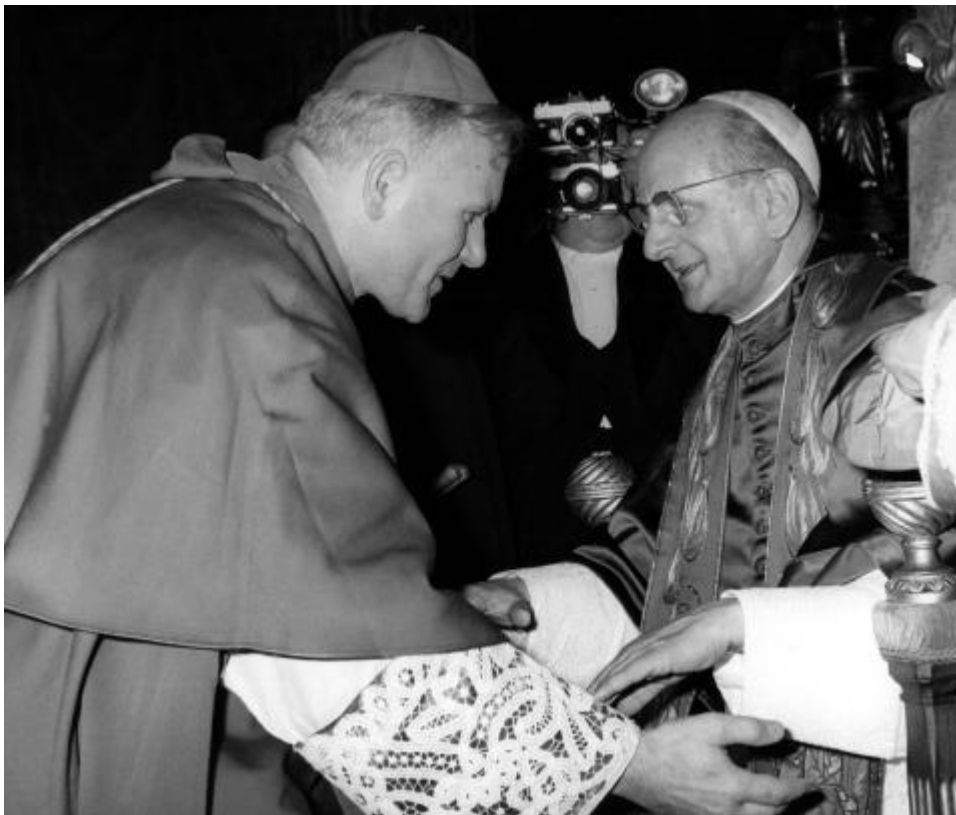
Cardinal Karol Wojtyla, who later became Pope John Paul II, is congratulated by Pope Paul VI at his installation as cardinal in the Sistine Chapel June 26, 1967.