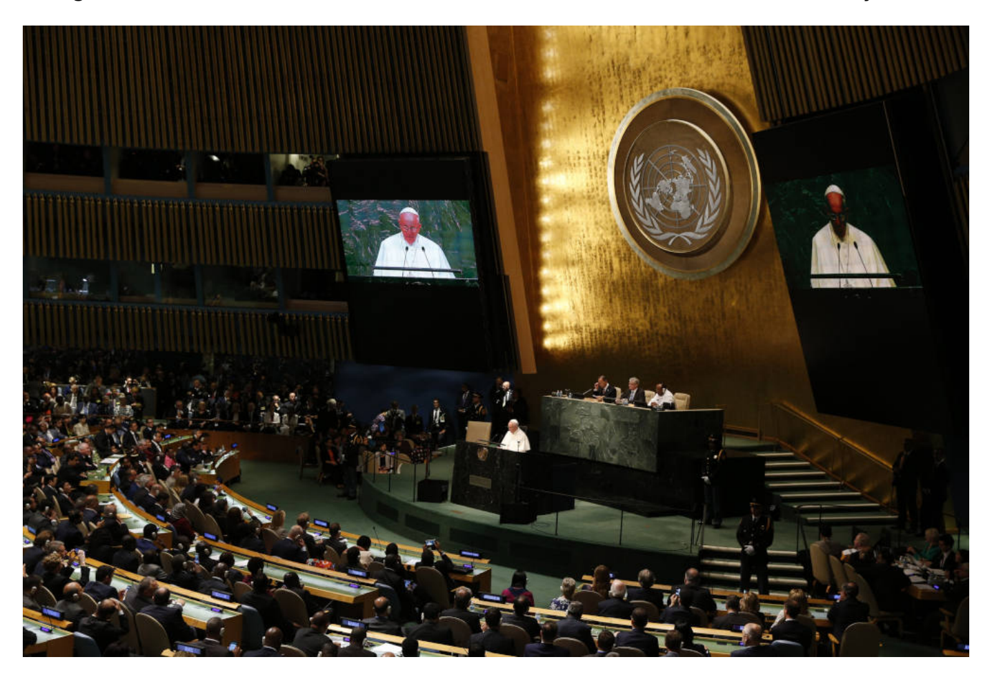
Pope Francis addresses the General Assembly of the United Nations in New York Sept. 25.

This is not about romanticism or naive idealism. It is about surviving and thriving. It is about transforming our economies, our societies and our individual lives in service of a greater vision — one that Francis has articulated with remarkable clarity.