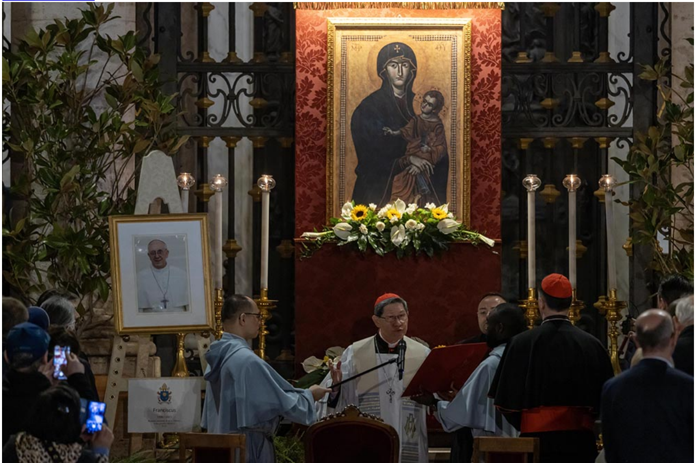
Philippine Cardinal Luis Antonio Tagle leads the recitation of the rosary for the repose of the soul of Pope Francis April 24, 2025, at Rome's Basilica of St. Mary Major, where the pope is to be buried April 26.