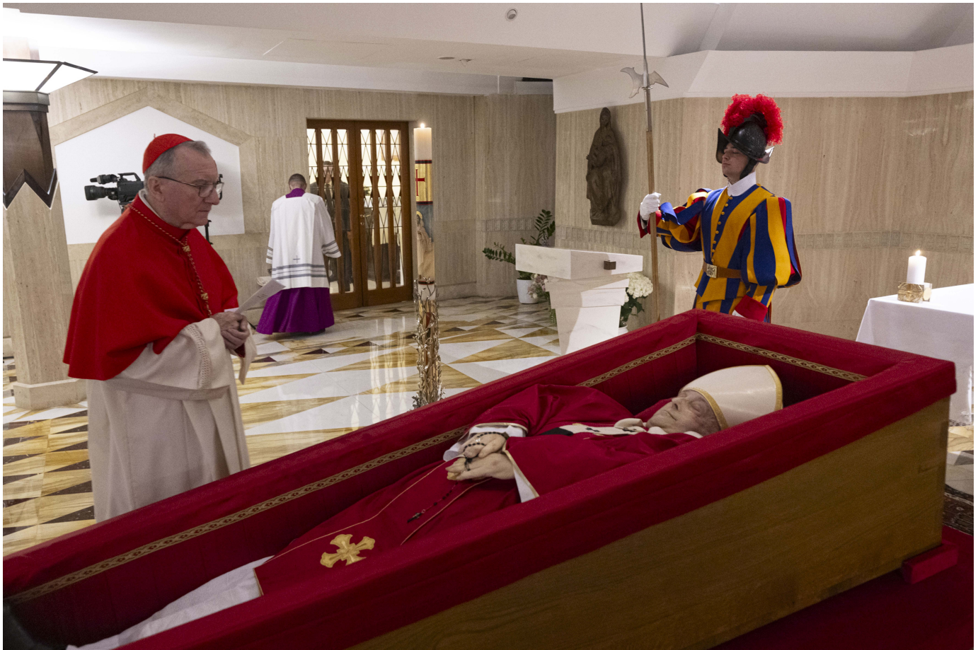
Cardinal Pietro Parolin stands by the pope's coffin in the chapel of Francis' residence at the Vatican April 21, 2025.

Despite Cardinal Giovanni Battista Re's strong backing of Francis' top priorities during his funeral Mass April 26, the dean of the College of Cardinals failed to offer one mention of what many see as Francis' legacy: synodality.